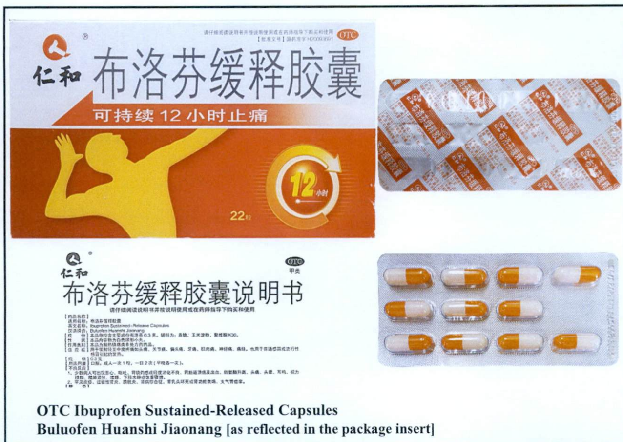
Figure 4. Unregistered drug

FDA Post-Marketing Surveillance (PMS) activities have verified that the abovementioned drug products have not gone through the registration process of the Agency and have not been issued with proper authorization in the form of Certificate of Product Registration. Thus, the Agency cannot guarantee their quality, safety and efficacy. Therefore, consumption of such violative products may pose potential danger or injury to health.