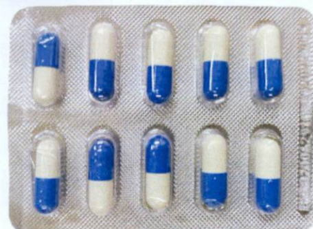
Levofloxacin Hydrochloride Capsules [Label in Foreign Language]