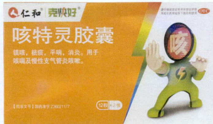
Figure 2. Unregistered drug