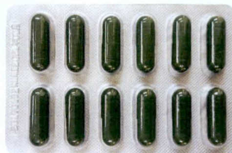
OTC Keteling Jiaonang [as reflected in the package insert]