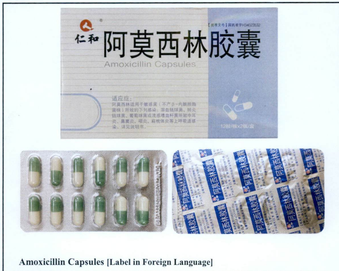
Amoxicillin Capsules [Label in Foreign Language]

The Food and Drug Administration (FDA) advises the public against the purchase and use of the following unregistered drug products: