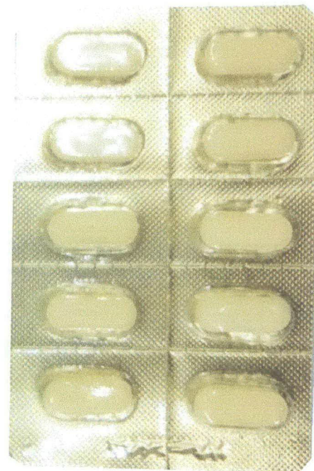
Figure 1. Unregistered MAXMAN Supplement, 2800mg