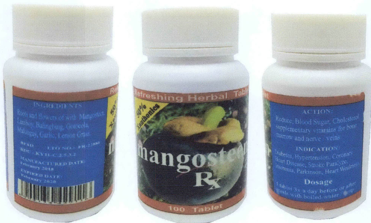
Figure 4. Unregistered MANGOSTEEN RX