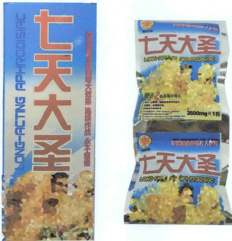
Figure 3. Unregistered Sheng Long Tonify Yang Long-Acting Aphrodisiac