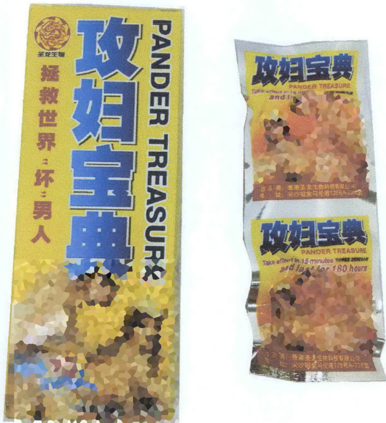
Figure 2. Unregistered PANDER TREASURE, 3500mg