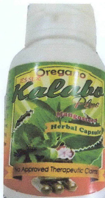
Figure 6. Unregistered JES.SER OREGANO Kalabo Plus Mangosteen Herbal Capsule