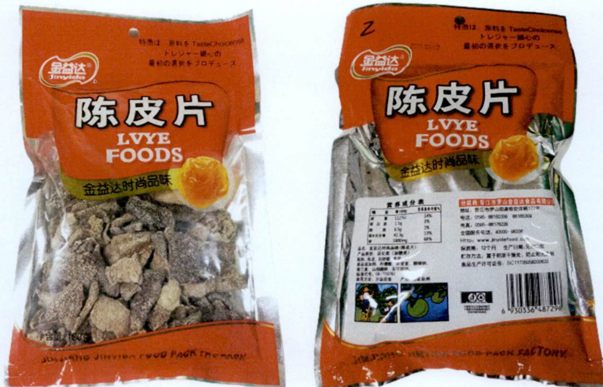
Figure 2. Unregistered JINYIDA LVYE FOODS Dried Food Product in Red and Transparent Packaging (In Foreign Language)