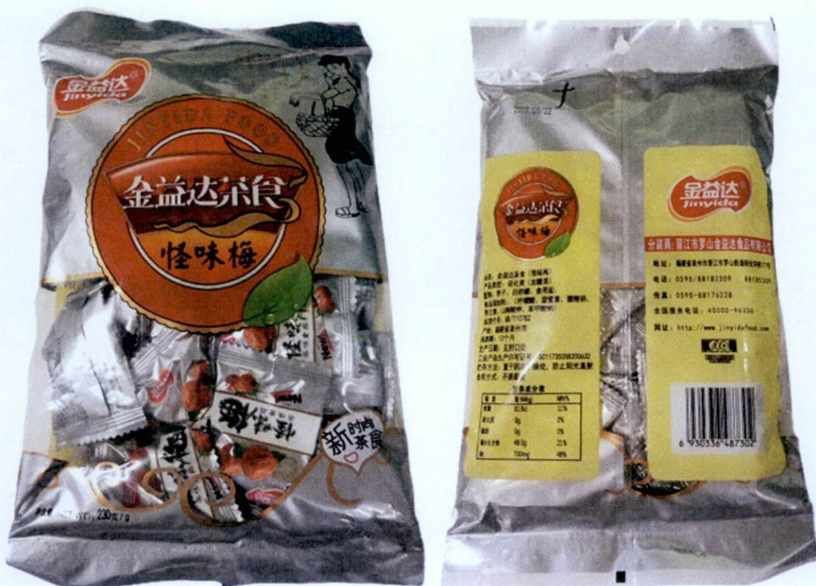
Figure 3. Unregistered JINYIDA Candy in Silver Packaging with Image of Girl and Red Fruit (In Foreign Language)