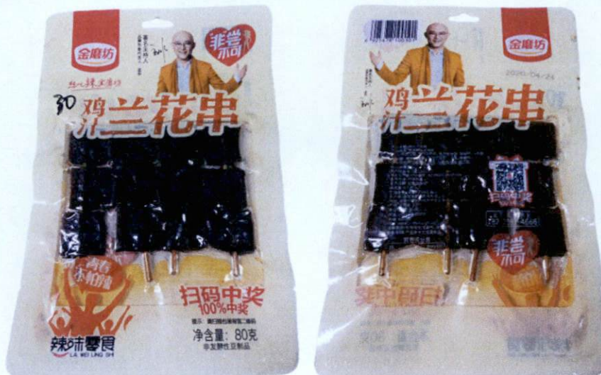
Figure 1. Unregistered LA WEI LING SHI Food Product with Stick in Light Yellow Plastic with Transparent Center and Image of a Man (In Foreign Language)

The Food and Drug Administration (FDA) warns all healthcare professionals and the general public NOT TO PURCHASE AND CONSUME the following unregistered food products: