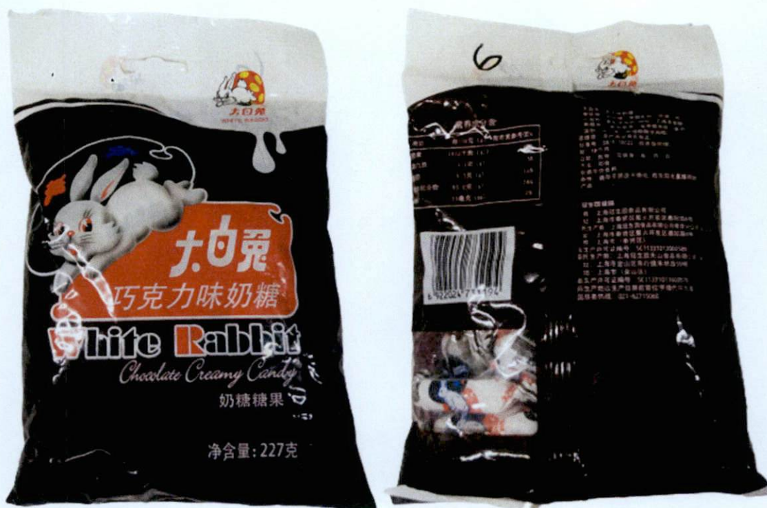
Figure 4. Unregistered WHITE RABBIT Chocolate Creamy Candy in Dark Brown Packaging (In Foreign Language)