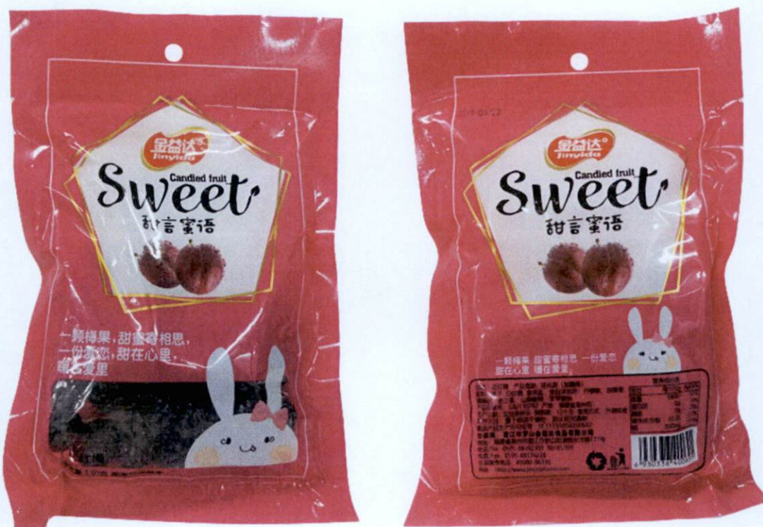
Figure 5. Unregistered JINYIDA Sweet Candied Fruit in Pink Bag with Image of Bunny (In Foreign Language)