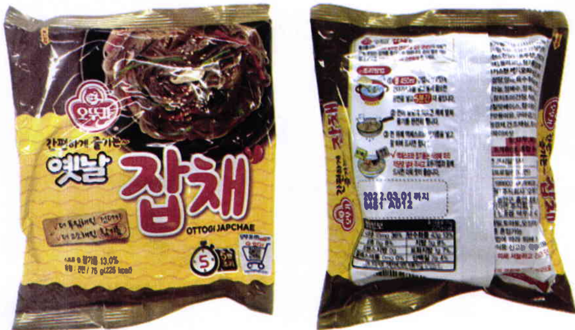
Figure 1. Unregistered OTTOGI Japchae (In Foreign Language)

The Food and Drug Administration (FDA) warns all healthcare professionals and the general public NOT TO PURCHASE AND CONSUME the following unregistered food products: