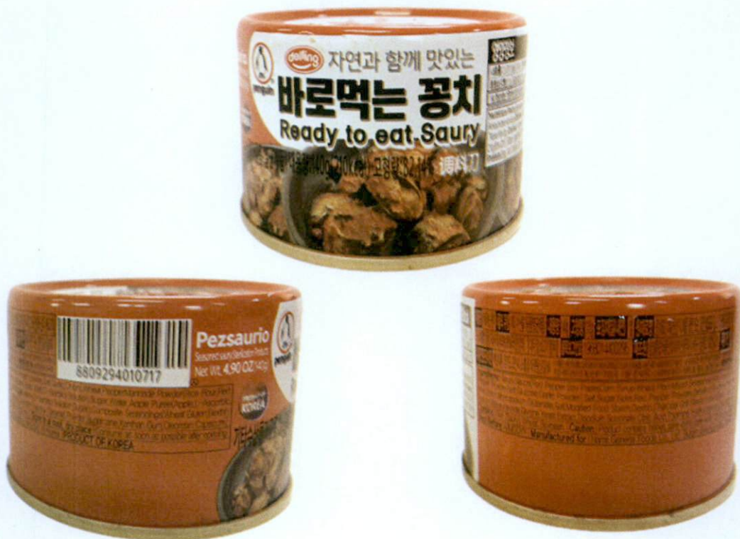
Figure 3. Unregistered DELLING Ready to Eat Saury Pezsaurio Seasoned Saury (In Foreign Language)