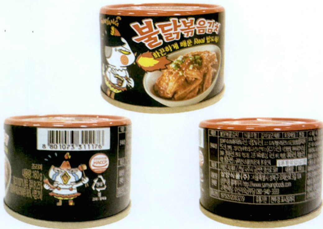
Figure 2. Unregistered SAMYANG Canned Food with Kimchi Image (In Foreign Language)