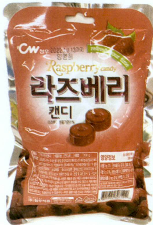
Figure 4. Unregistered CW Raspberry Candy (In Foreign Language)