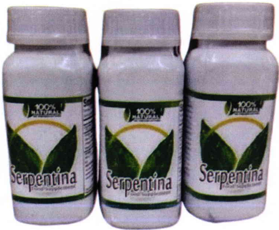
Figure 2. Unregistered NATURAL HERB Serpentina Food Supplement