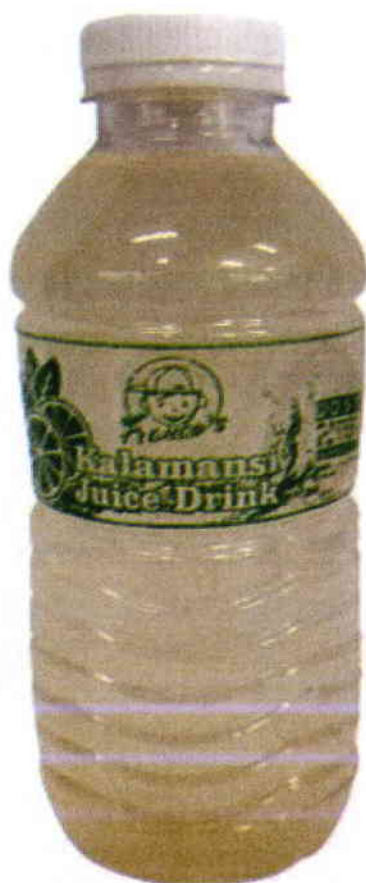
Figure 4. Unregistered FRANCO'S Kalamansi Juice Drink

The FDA verified through online monitoring or post-marketing surveillance that the abovementioned food supplements and food products are not registered and no corresponding Certificates of Product Registration (CPR) have been issued. Pursuant to the Republic Act No. 9711, otherwise known as the “Food and Drug Administration Act of 2009”, the manufacture, importation, exportation, sale, offering for sale, distribution, transfer, non-consumer use, promotion, advertising or sponsorship of health products without the proper authorization is prohibited.