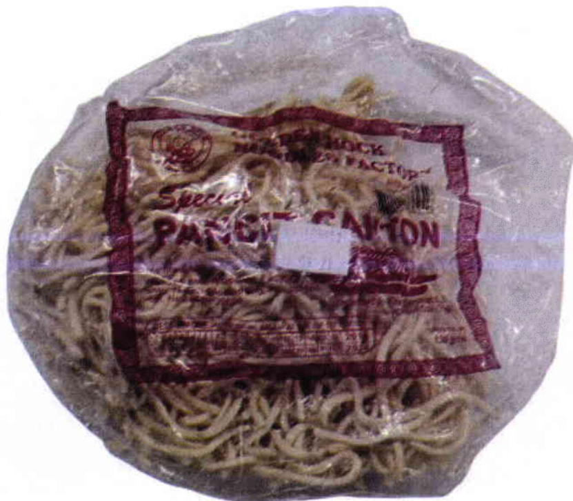
Figure 3. Unregistered GOLDEN HOCK NOODLES FACTORY Special Pancit Canton-Round