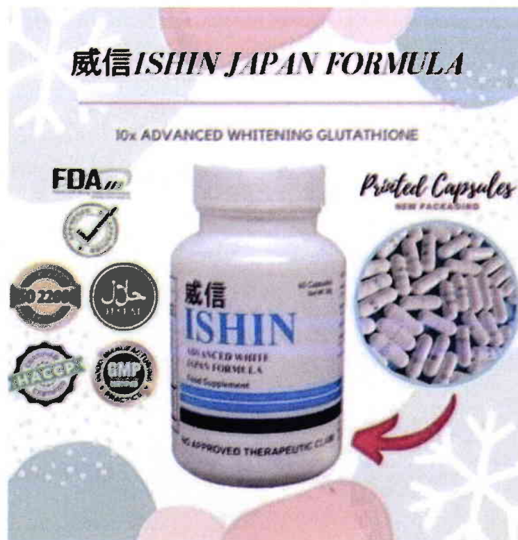
Figure 1. Unregistered ISHIN Advanced White Japan Formula Food Supplement

The Food and Drug Administration (FDA) warns all healthcare professionals and the general public NOT TO PURCHASE AND CONSUME the following unregistered food supplements and food products: