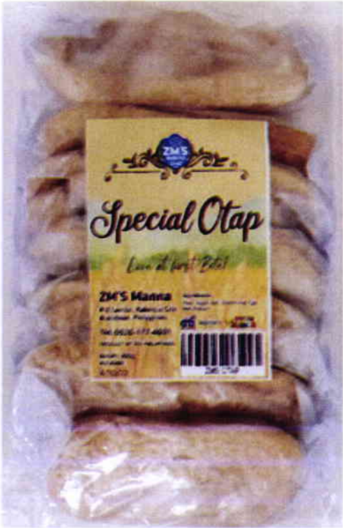
Figure 3. Unregistered ZM'S MANNA Special Otap, Net Wt. 100g