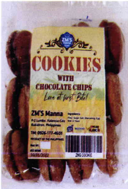
Figure 2. Unregistered ZM'S MANNA Cookies with Chocolate Chips, Net Wt. 100g