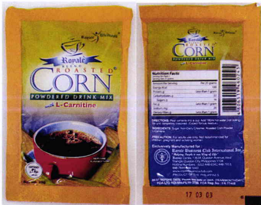
Figure 1. Unregistered ROYALE WELLNESS Royale Blend Roasted Corn Powdered Drink Mix with L-Carnitine, Net Wt. 25g

The Food and Drug Administration (FDA) warns all healthcare professionals and the general public NOT TO PURCHASE AND CONSUME the following unregistered food products and food supplements: