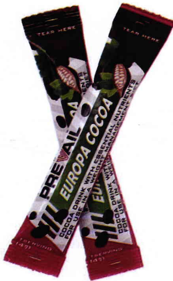
Figure 5. Unregistered VALENTUS Prevail Europa Cocoa – Cocoa Drink with Essential Nutrients

The FDA verified through online monitoring or post-marketing surveillance that the abovementioned food products and food supplements are not registered and no corresponding Certificates of Product Registration (CPR) have been issued. Pursuant to the Republic Act No. 9711, otherwise known as the “Food and Drug Administration Act of 2009”, the manufacture, importation, exportation, sale, offering for sale, distribution, transfer, non-consumer use, promotion, advertising or sponsorship of health products without the proper authorization is prohibited.