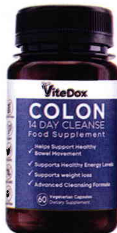
Figure 1. Unregistered VITEDOX Colon 14-day Cleanse Food Supplement, 60 Vegetarian Capsules

The Food and Drug Administration (FDA) warns all healthcare professionals and the general public NOT TO PURCHASE AND CONSUME the following unregistered food products and food supplements: