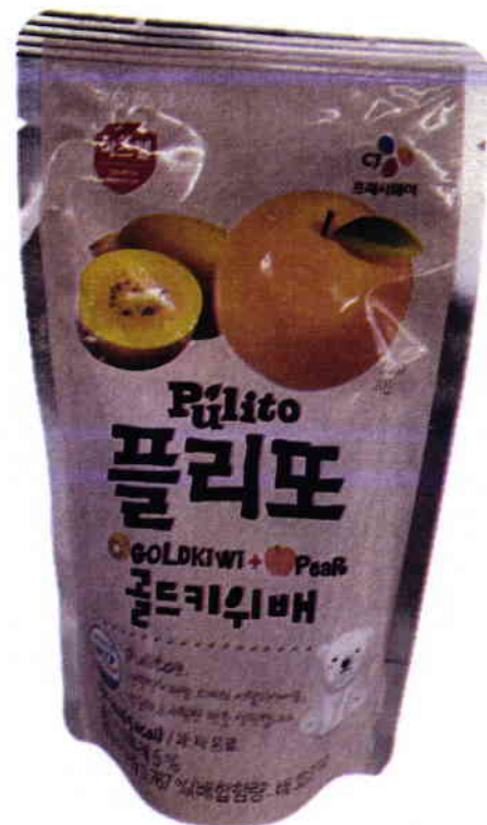
Figure 5. Unregistered CJ Pulito Gold Kiwi+Pear in a Light Brown packaging with images of Gold Kiwi and Pear, 130 mL (Labels are in foreign characters)