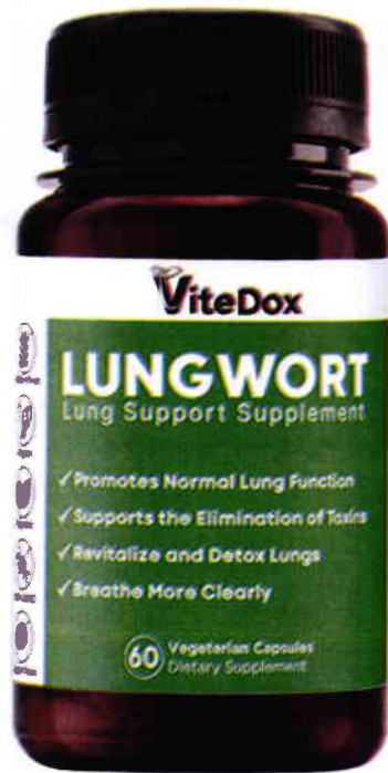
Figure 2. Unregistered VITEDOX Lungwort Lung Support Supplement, 60 vegetarian capsules