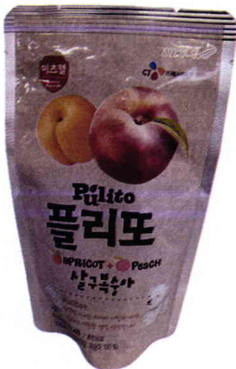
Figure 4. Unregistered CJ Pulito Apricot+Peach in a Light Brown packaging with images of Apricot and Peach, 130 mL (Labels are in foreign characters)