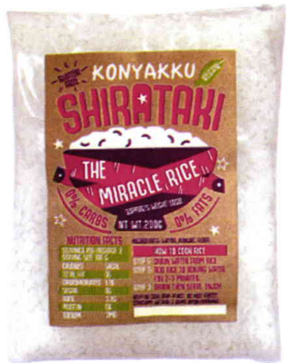
Figure 3. Unregistered KONYAKKU Shirataki The Miracle Rice, 200 g