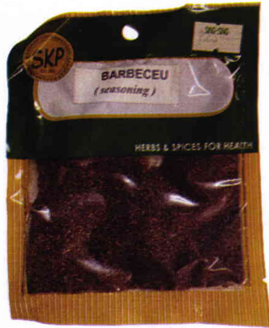
Figure 3. Unregistered SANGKAP KAPAMPANGAN Barbecue Seasoning