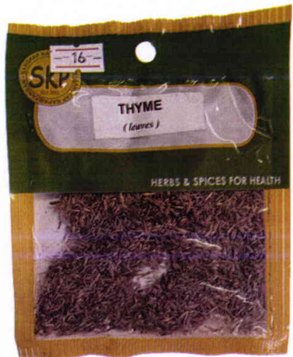
Figure 5. Unregistered SANGKAP KAPAMPANGAN Thyme Leaves