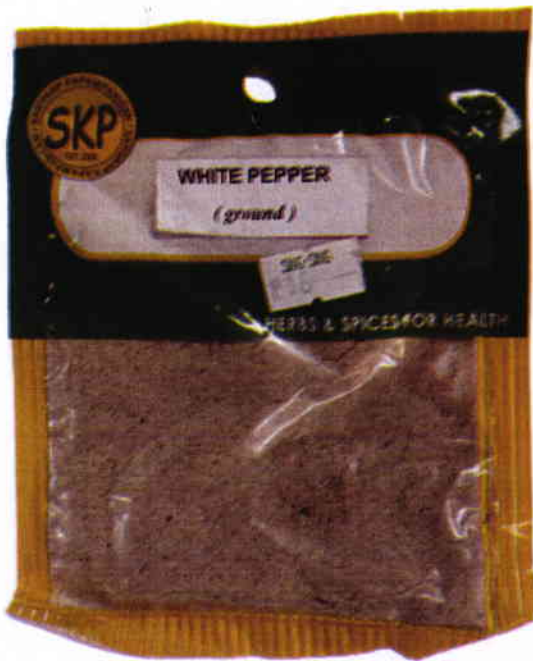
Figure 2. Unregistered SANGKAP KAPAMPANGAN White Pepper Ground