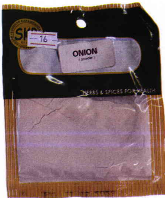
Figure 4. Unregistered SANGKAP KAPAMPANGAN Onion Powder