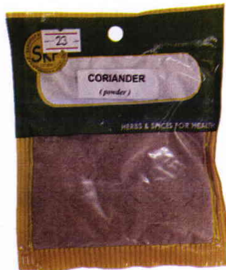
Figure 1. Unregistered SANGKAP KAPAMPANGAN Coriander Powder

The Food and Drug Administration (FDA) warns all healthcare professionals and the general public NOT TO PURCHASE AND CONSUME the following unregistered food products: