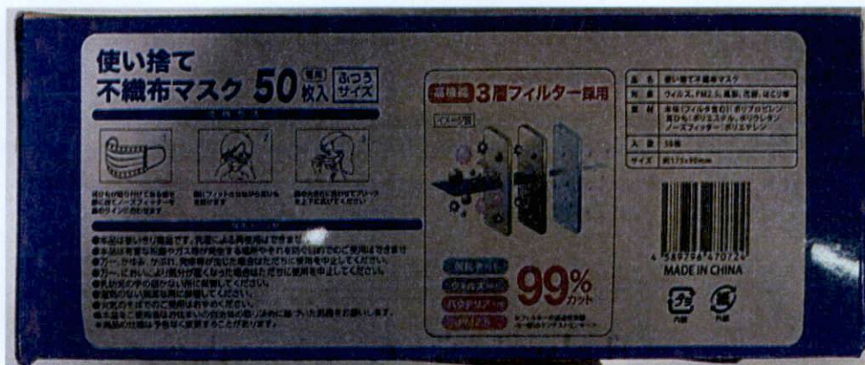
Figure 1. Misbranded Face Mask in Foreign Characters