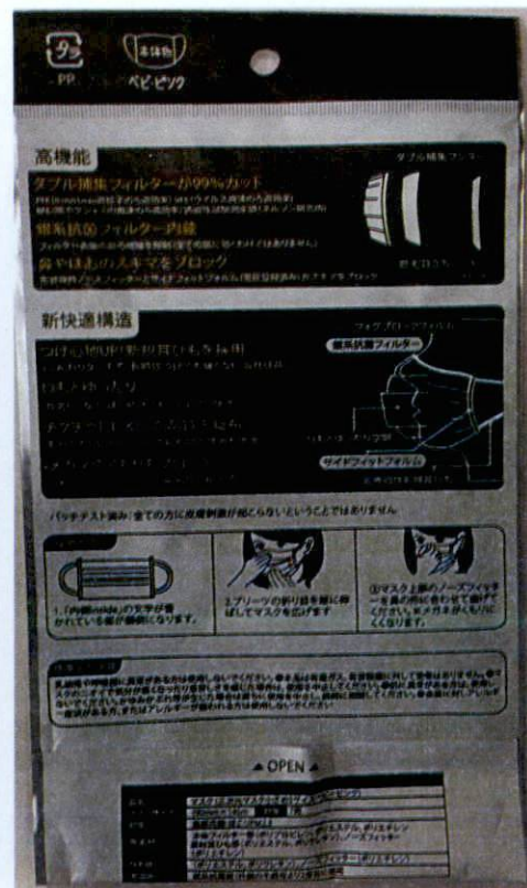
Figure 2. Misbranded Face Mask in Foreign Characters

The FDA verified through post-marketing surveillance that the abovementioned medical device products are being offered for sale in the local market.