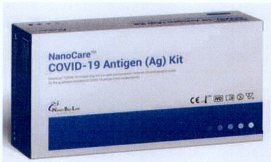
Figure 1. Uncertified NanoCare™ COVID-19 Antigen (AG) Kit

The Food and Drug Administration (FDA) warns all healthcare professionals and the general public NOT TO PURCHASE AND USE the uncertified COVID-19 test kit: