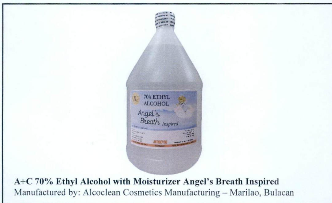
Figure 1. Unregistered drug

The Food and Drug Administration (FDA) advises the public against the purchase and use of the following unregistered drug products: