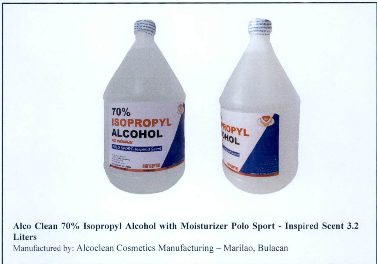
Figure 3. Unregistered drug