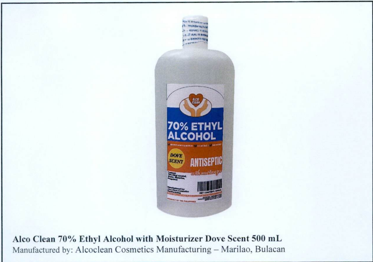
Figure 4. Unregistered drug