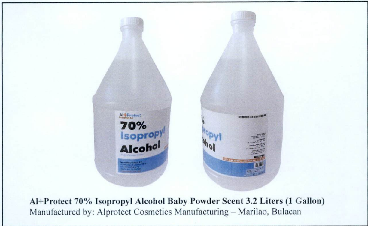
Figure 2. Unregistered drug