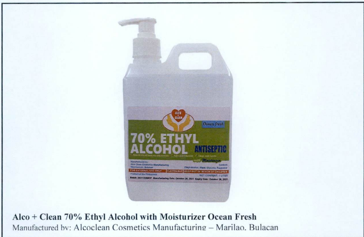
Figure 5. Unregistered drug