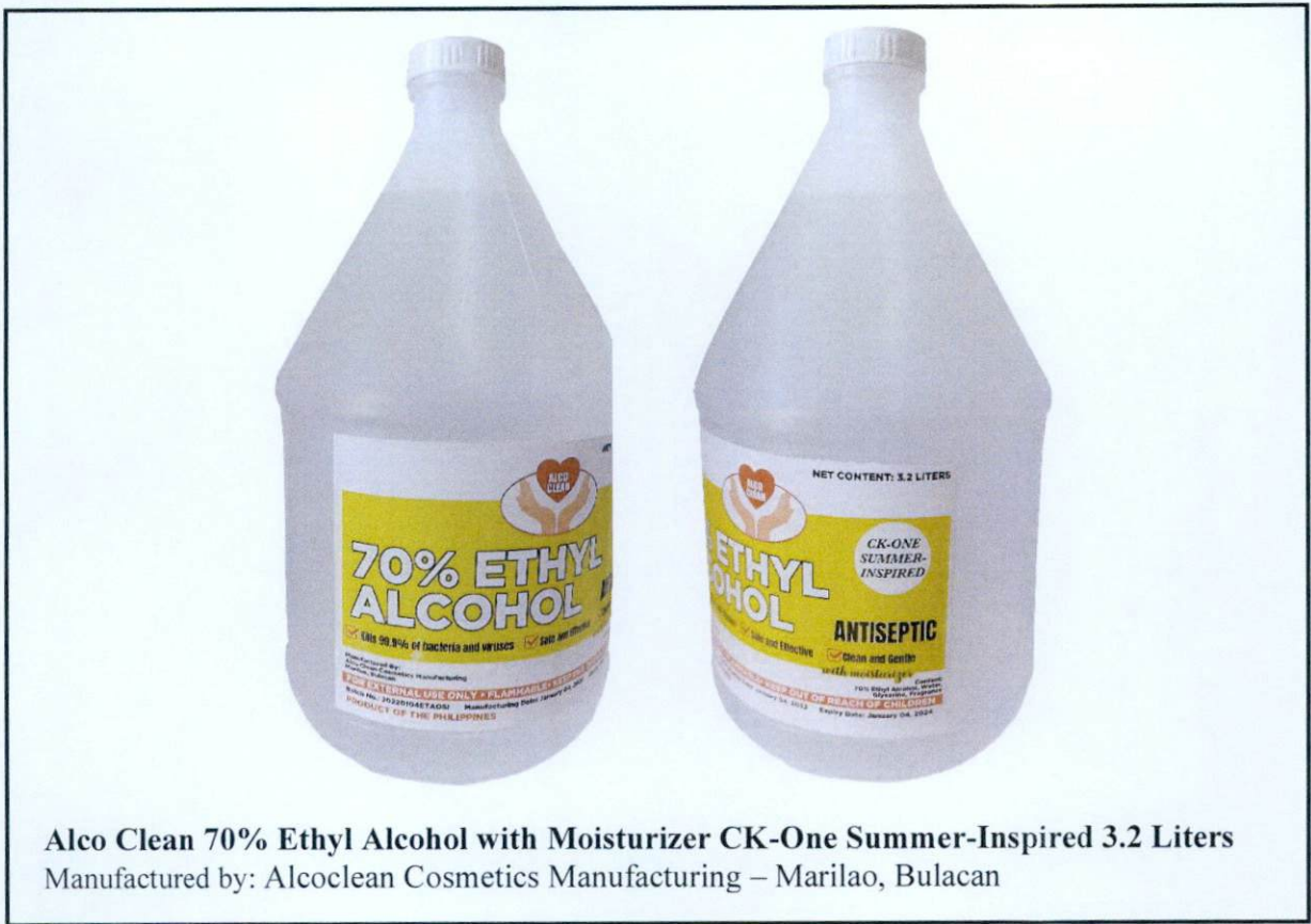
Figure 4. Unregistered drug