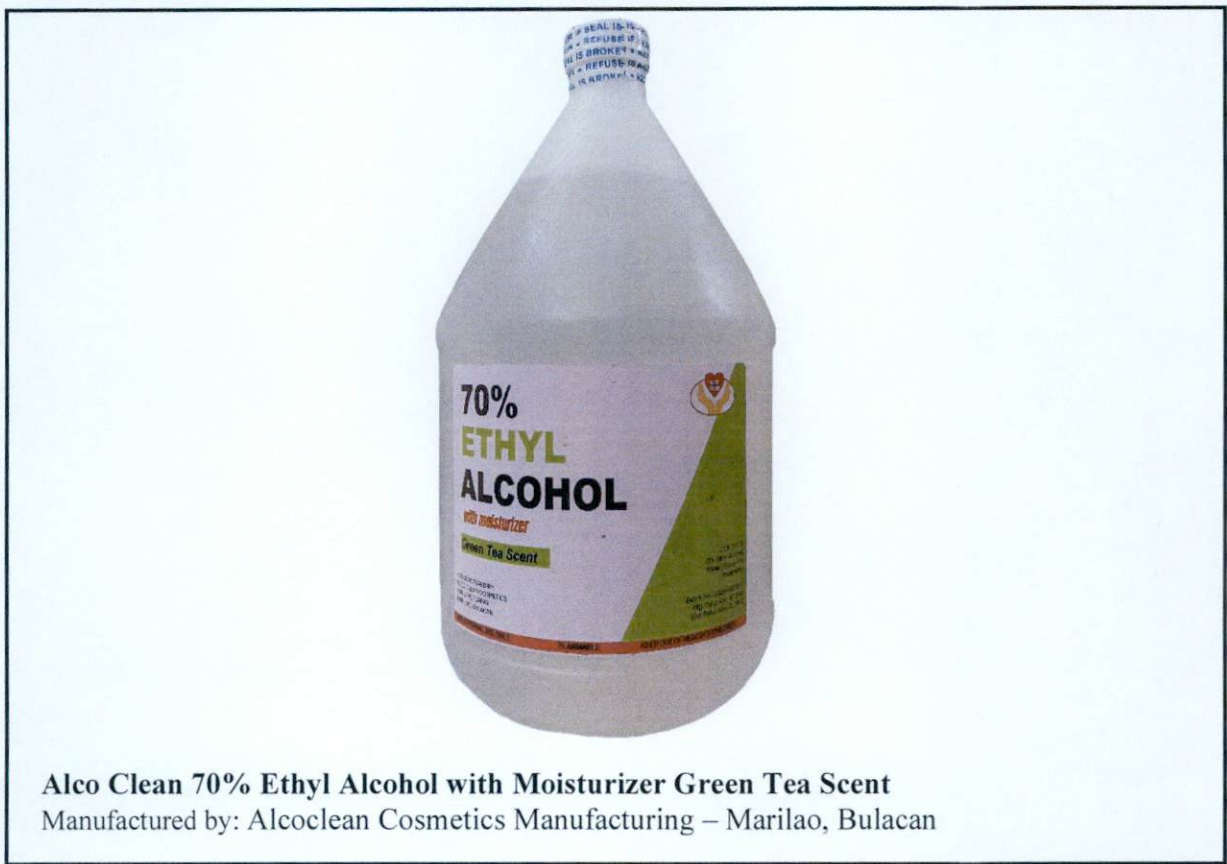
Figure 5. Unregistered drug