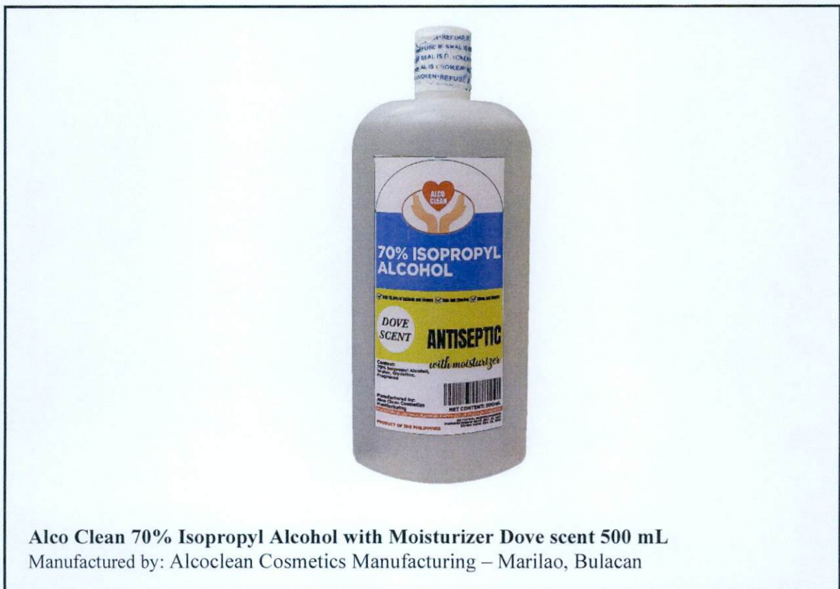
Alco Clean 70% Isopropyl Alcohol with Moisturizer Dove scent 500 mL Manufactured by: Alcoclean Cosmetics Manufacturing – Marilao, Bulacan