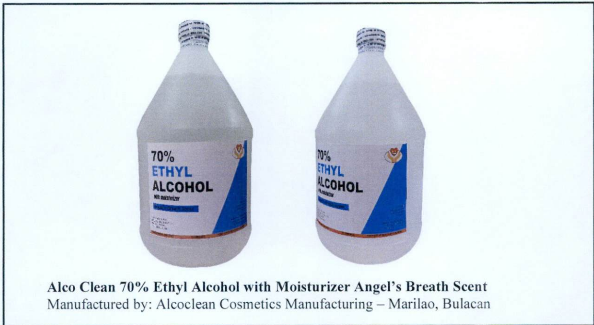
Alco Clean 70% Ethyl Alcohol with Moisturizer Angel's Breath Scent Manufactured by: Alcoclean Cosmetics Manufacturing – Marilao, Bulacan