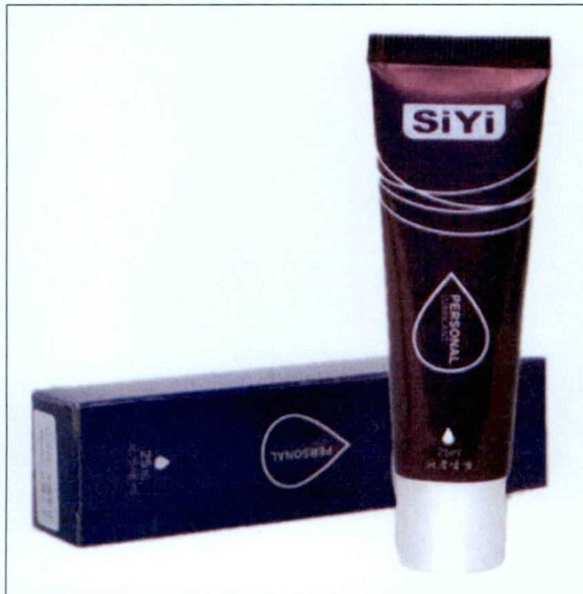
Figure 1. Unnotified SiYi Water-Based Lubricant

The Food and Drug Administration (FDA) warns all healthcare professionals and the general public NOT TO PURCHASE AND USE the unnotified medical device product: