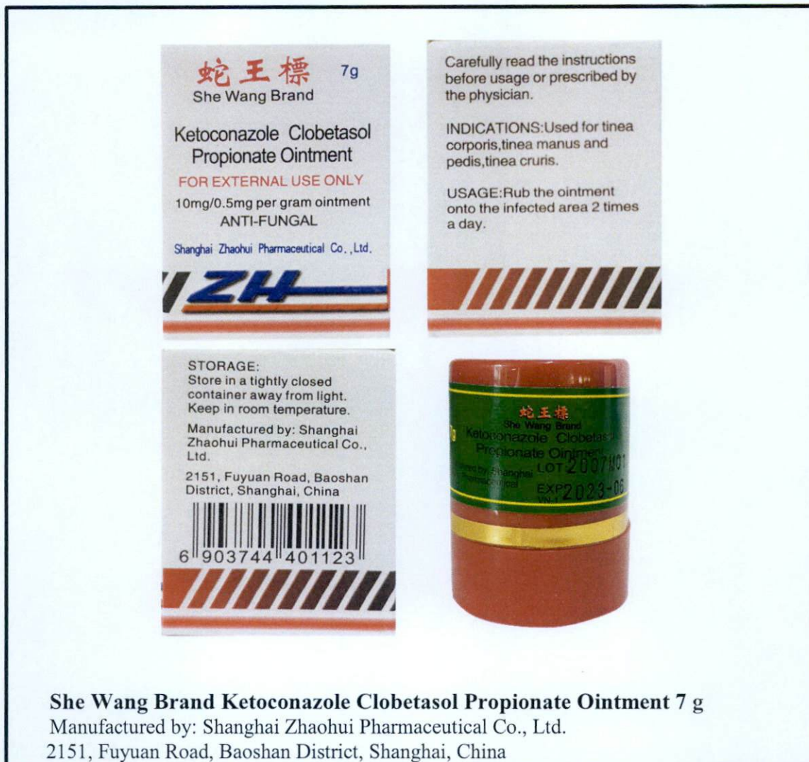
Figure 1: Unregistered drug product

The Food and Drug Administration (FDA) advises the public against the purchase and use of the unregistered drug product: