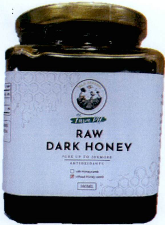
Figure 2. Unregistered FARM PH Raw Dark Honey