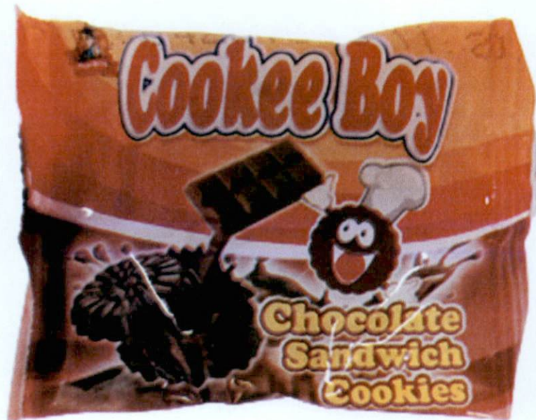
Figure 5. Unregistered MARBISC COOKEE BOY Chocolate Sandwich Cookie