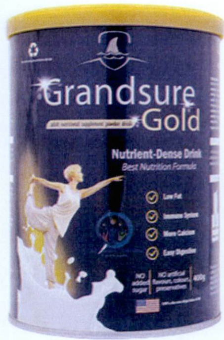
Figure 3. Unregistered GRANDSURE Gold Nutrient Dense Drink