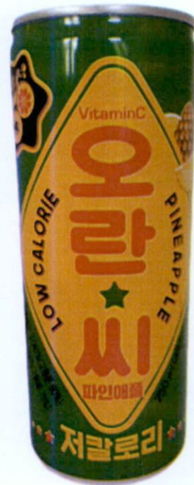
Figure 3. Unregistered Vitamin C Low Calorie Pineapple Drink (In Foreign Language)