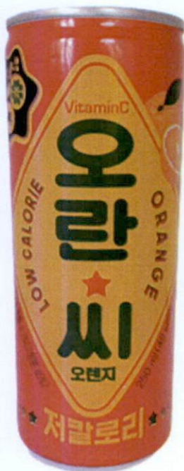
Figure 4. Unregistered Orange Vitamin C Low Calorie Orange Drink (In Foreign Language)