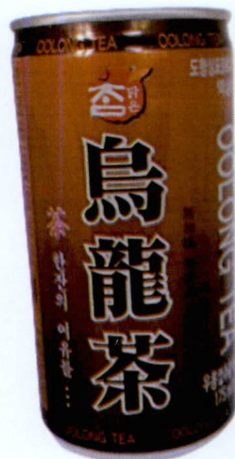
Figure 5. Unregistered Oolong Tea in Brown Can (In Foreign Language)