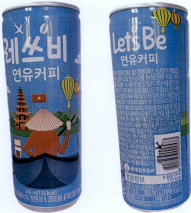
Figure 2. Unregistered LET'S BE Drink (In Foreign Language)