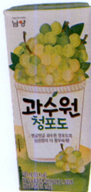
Figure 1. Unregistered ENJOY THE QUALITY Grape Juice Drink (In Foreign Language)

The Food and Drug Administration (FDA) warns all healthcare professionals and the general public NOT TO PURCHASE AND CONSUME the following unregistered food products: