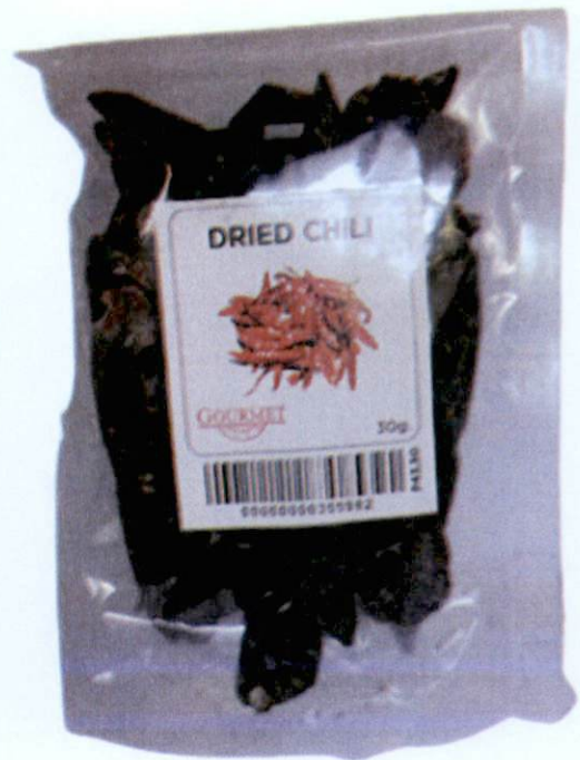
Figure 3. Unregistered GOURMET CLUB Dried Chili