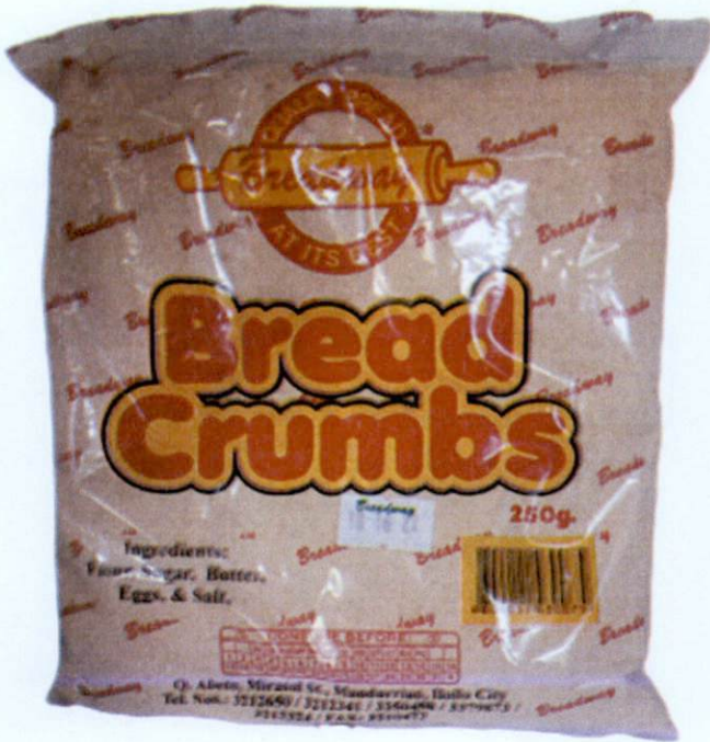
Figure 2. Unregistered BREADWAY Breadcrumbs