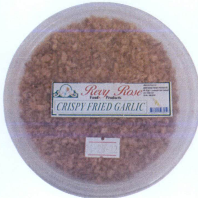
Figure 1. Unregistered REVY ROSE FOOD PRODUCTS Crispy Fried Garlic

The Food and Drug Administration (FDA) warns all healthcare professionals and the general public NOT TO PURCHASE AND CONSUME the following unregistered food products: