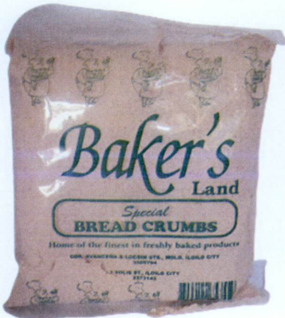
Figure 4. Unregistered BAKER'S LAND Special Bread Crumbs