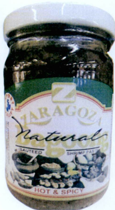
Figure 4. Unregistered ZARAGOSA Ginisang Bagoong (Sauteed Shrimp Paste) - Hot & Spicy, Net Wt. 240g