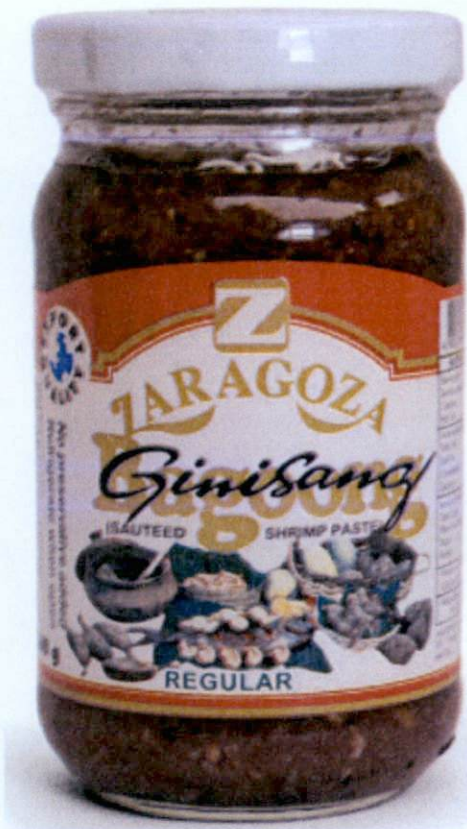
Figure 3. Unregistered ZARAGOZA Ginisang Bagoong (Sauteed Shrimp Paste) – Regular, Net Wt. 240g