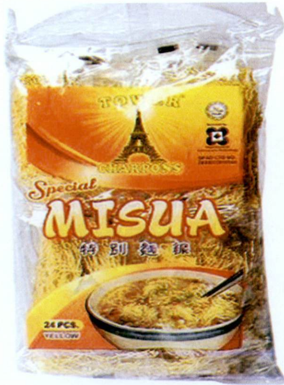
Figure 5. Unregistered TOWER CHARPONS Special Misua, 24pcs. Yellow

The FDA verified through online monitoring or post-marketing surveillance that the abovementioned food products are not registered and no corresponding Certificates of Product Registration (CPR) have been issued. Pursuant to the Republic Act No. 9711, otherwise known as the “Food and Drug Administration Act of 2009”, the manufacture, importation, exportation, sale, offering for sale, distribution, transfer, non-consumer use, promotion, advertising or sponsorship of health products without the proper authorization is prohibited.