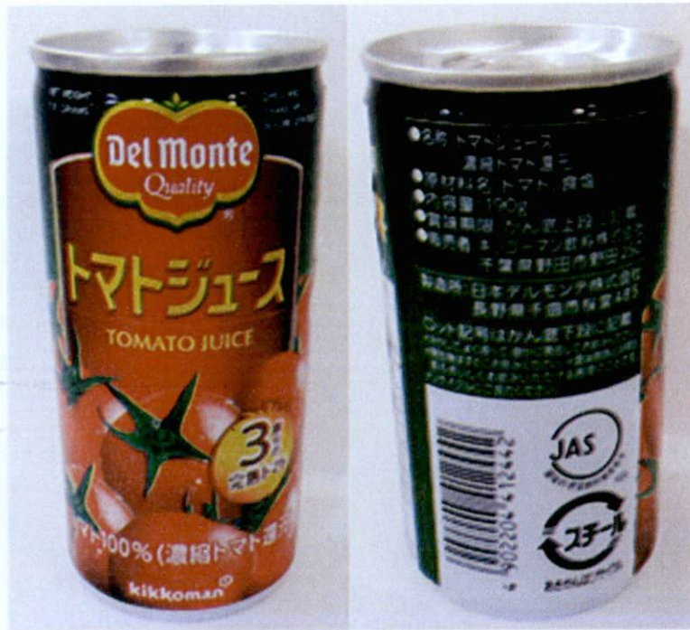
Figure 2. Unregistered DEL MONTE Tomato Juice, 190grams (In foreign language)