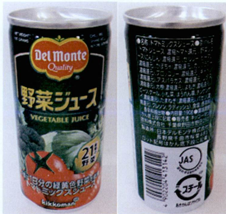
Figure 1. Unregistered DEL MONTE Vegetable Juice, 190grams (In foreign language)

The Food and Drug Administration (FDA) warns all healthcare professionals and the general public NOT TO PURCHASE AND CONSUME the following unregistered food products: