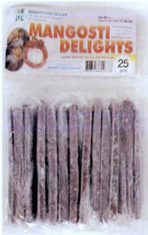
Figure 4. Unregistered MEMER FOOD DEALER Mangosteen Delights, 25pcs.