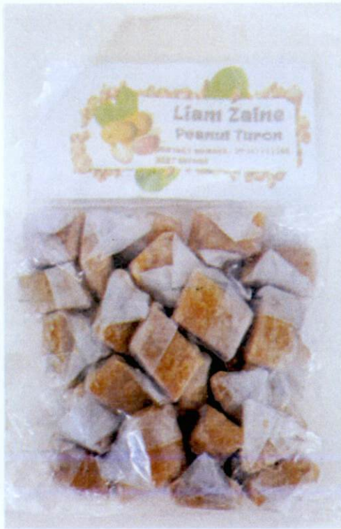
Figure 2. Unregistered LIAM ZAINÉ Peanut Turon