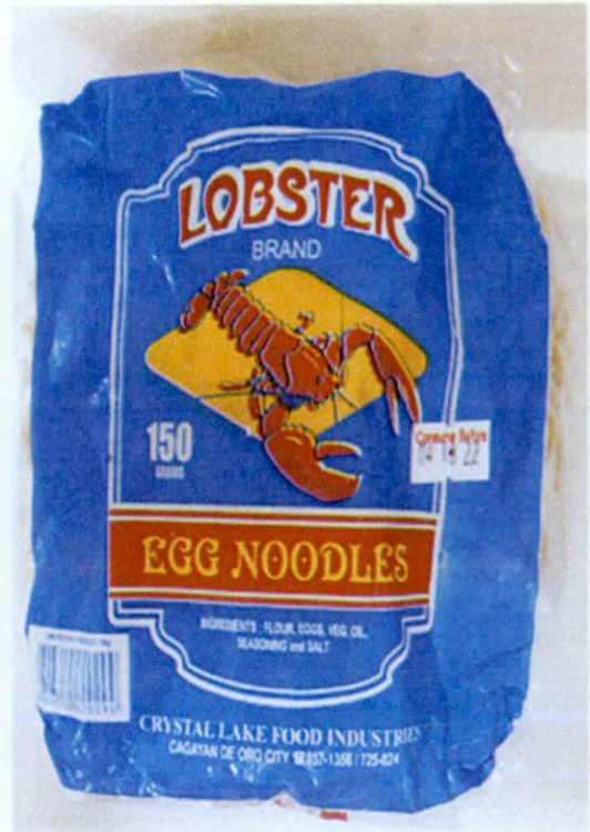
Figure 3. Unregistered LOBSTER BRAND . Egg Noodles, 150 Grams