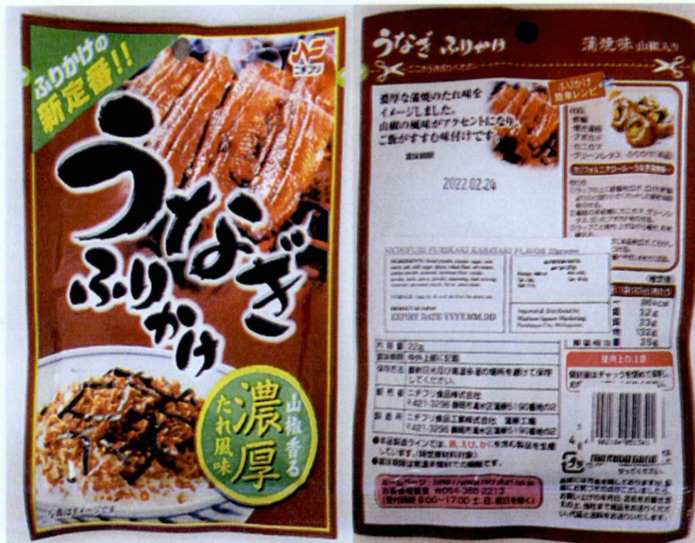
Figure 5. Unregistered NICHIFURI Furikaki Kabayaki Flavor, 22grams

The FDA verified through online monitoring or post-marketing surveillance that the abovementioned food products are not registered and no corresponding Certificates of Product Registration (CPR) have been issued. Pursuant to the Republic Act No. 9711, otherwise known as the “Food and Drug Administration Act of 2009”, the manufacture, importation, exportation, sale, offering for sale, distribution, transfer, non-consumer use, promotion, advertising or sponsorship of health products without the proper authorization is prohibited.