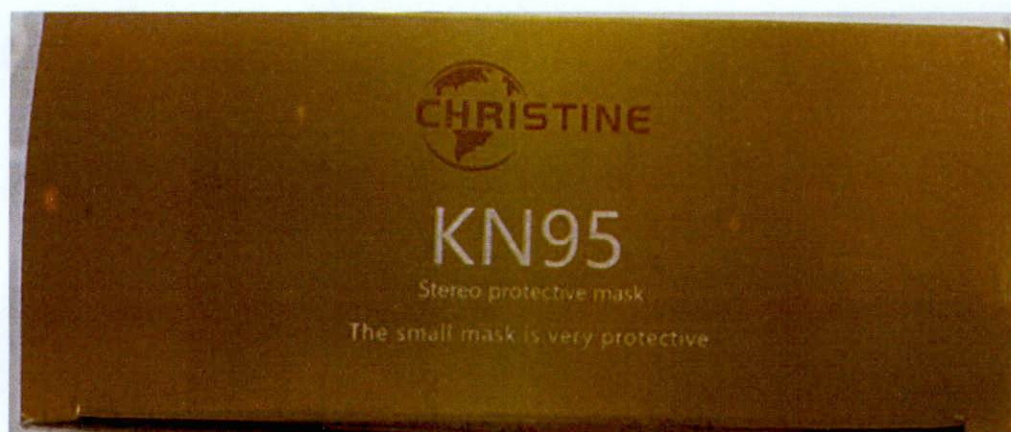
Figure 1. Unnotified Christine KN95 Stereo Protective Mask