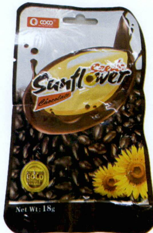
Figure 3. Unregistered COCO FALL IN LOVE WITH Chocolate Sunflower Seeds