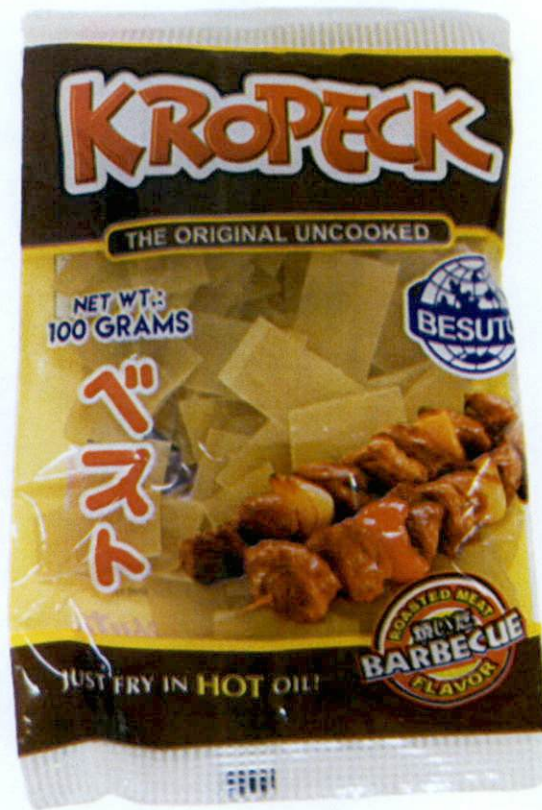
Figure 2. Unregistered KROPECK BESUTO The Original Uncooked Roasted Meat Barbecue Flavor