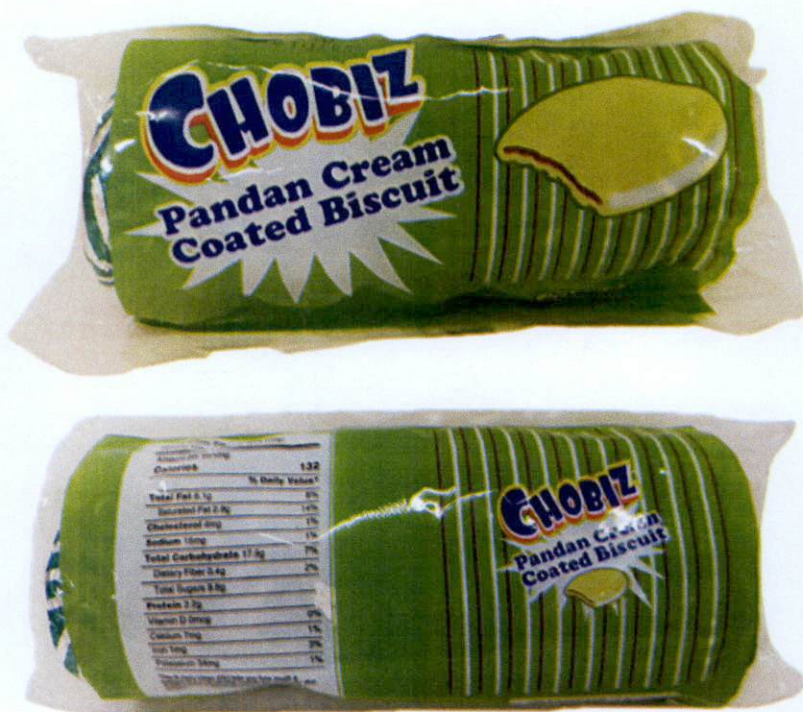
Figure 1. Unregistered CHOBIZ Pandan Cream Coated Biscuit

The Food and Drug Administration (FDA) warns all healthcare professionals and the general public NOT TO PURCHASE AND CONSUME the following unregistered food products: