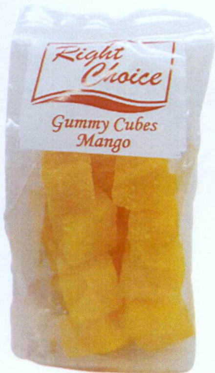
Figure 4. Unregistered RIGHT CHOICE Gummy Cubes Mango