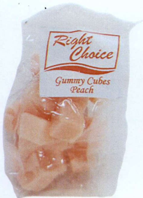
Figure 2. Unregistered RIGHT CHOICE Gummy Cubes Peach