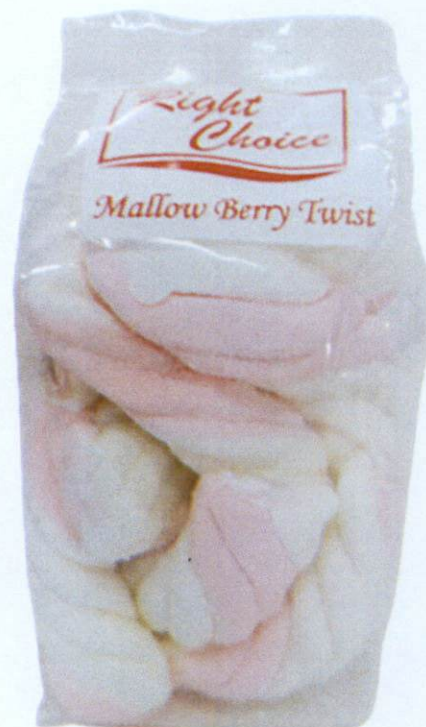
Figure 5. Unregistered RIGHT CHOICE Mallow Berry Twist