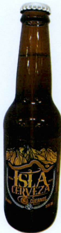
Figure 1. Unregistered ISLA CERVEZA Cuernos Pale Ale

The Food and Drug Administration (FDA) warns all healthcare professionals and the general public NOT TO PURCHASE AND CONSUME the following unregistered food products: