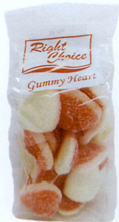
Figure 3. Unregistered RIGHT CHOICE Gummy Heart