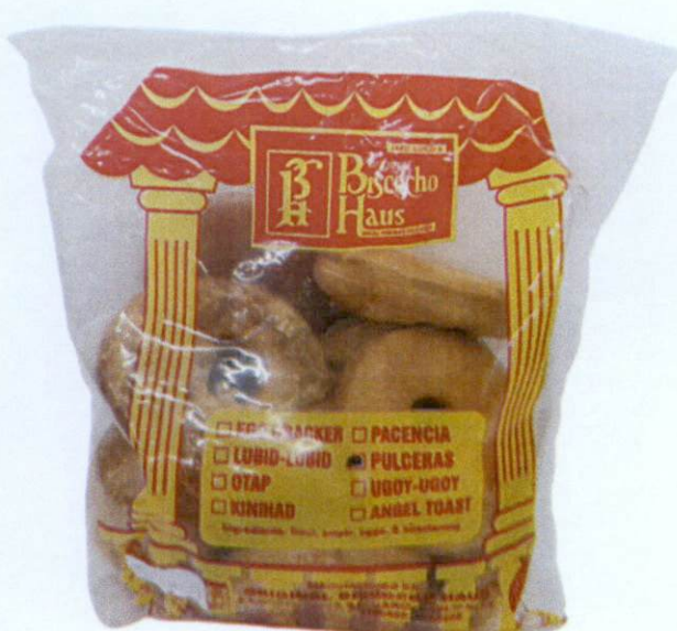
Figure 4. Unregistered ORIGINAL BISCOCHO HAUS Pulceras