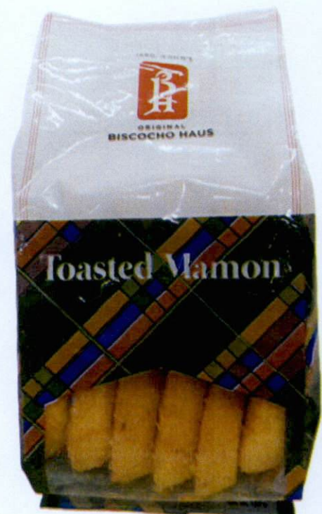
Figure 5. Unregistered ORIGINAL BISCOCHO HAUS Toasted Mamon