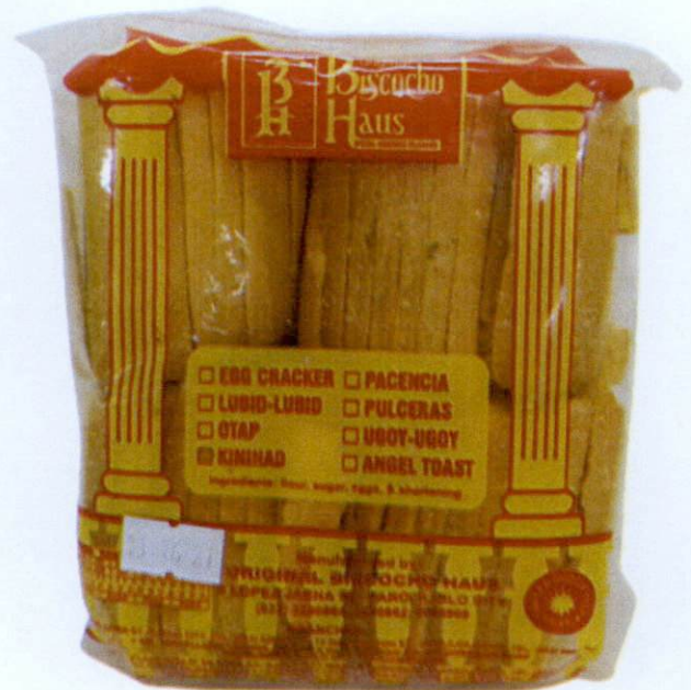
Figure 3. Unregistered ORIGINAL BISCOCHO HAUS Kinihad