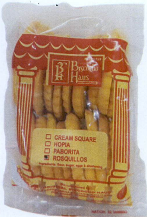
Figure 2. Unregistered ORIGINAL BISCOCHO HAUS Rosquillos