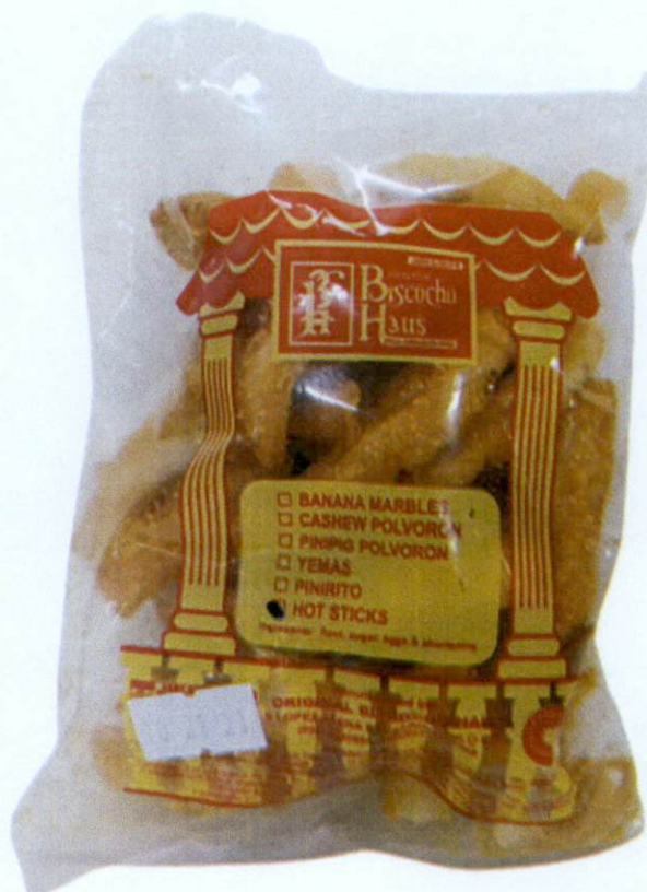
Figure 1. Unregistered ORIGINAL BISCOCHO HAUS Hot Sticks

The Food and Drug Administration (FDA) warns all healthcare professionals and the general public NOT TO PURCHASE AND CONSUME the following unregistered food products: