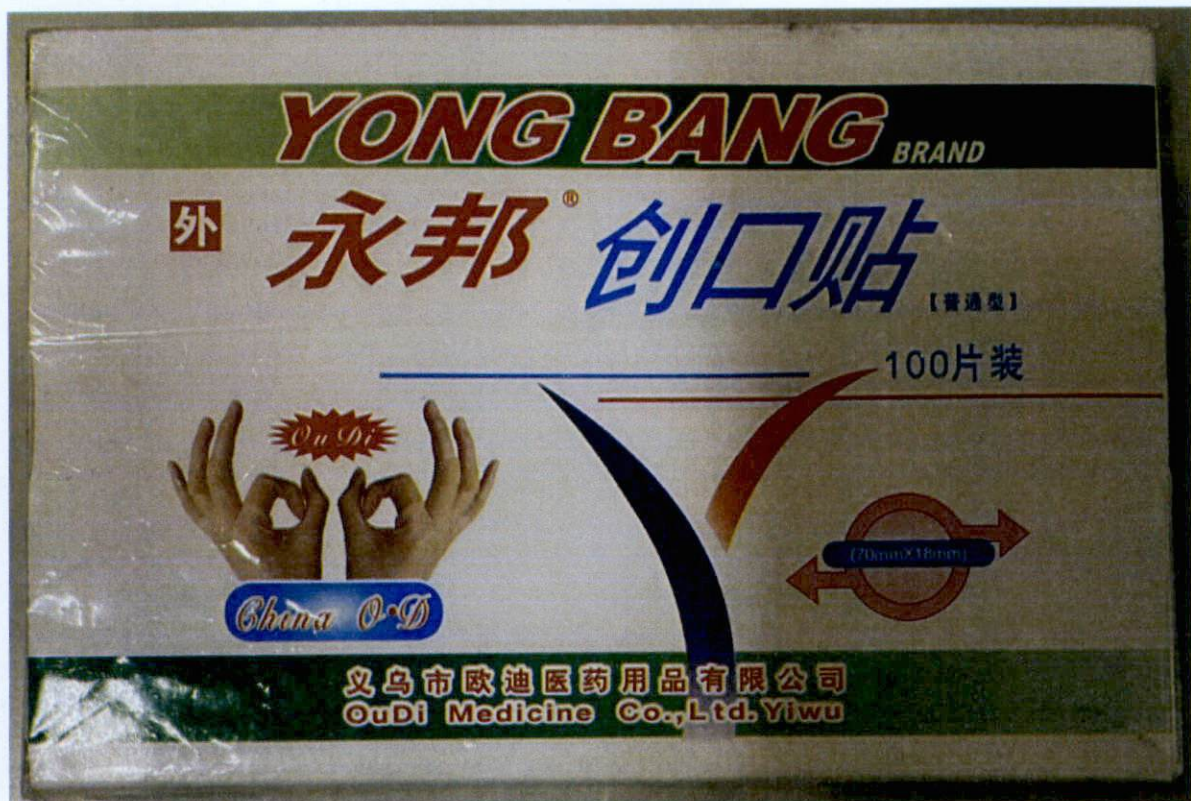
Figure 1. Unnotified Yong Bang – Flexible Fabric Bandages

The Food and Drug Administration (FDA) warns all healthcare professionals and the general public NOT TO PURCHASE AND USE the unnotified medical device product: