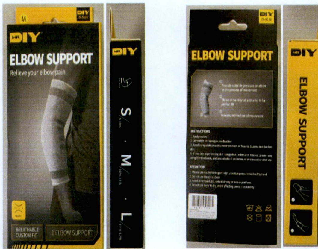
Figure 1. Unnotified Mr. DIY Elbow Support

The Food and Drug Administration (FDA) warns all healthcare professionals and the general public NOT TO PURCHASE AND USE the unnotified medical device products: