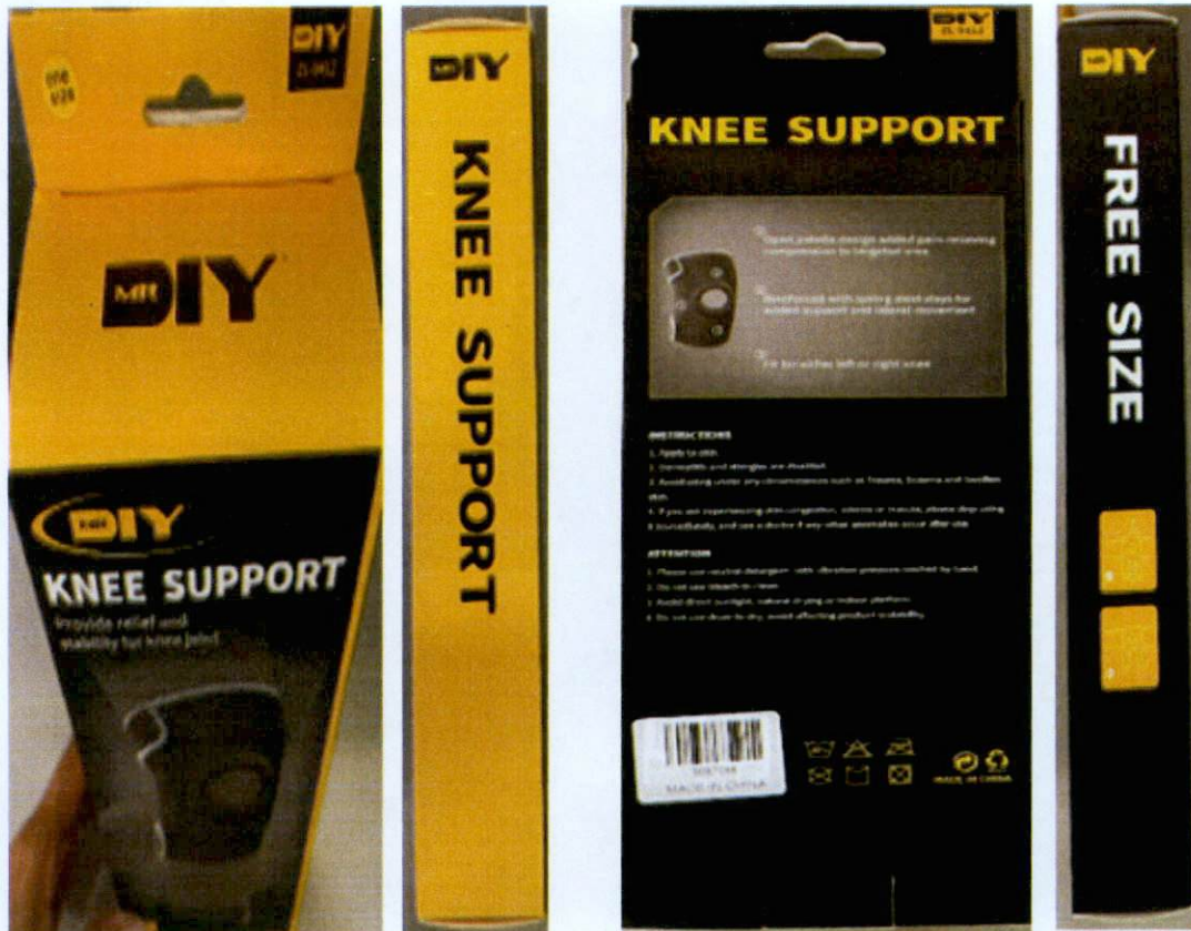
Figure 1. Unnotified Mr. DIY Knee Support

The FDA verified through post-marketing surveillance that the above mentioned medical device products are not notified and no corresponding Product Notification Certificates have been issued. Pursuant to the Republic Act No. 9711, otherwise known as the “Food and Drug Administration Act of 2009”, the manufacture, importation, exportation, sale, offering for sale, distribution, transfer, non-consumer use, promotion, advertising or sponsorship of health products without the proper authorization is prohibited.