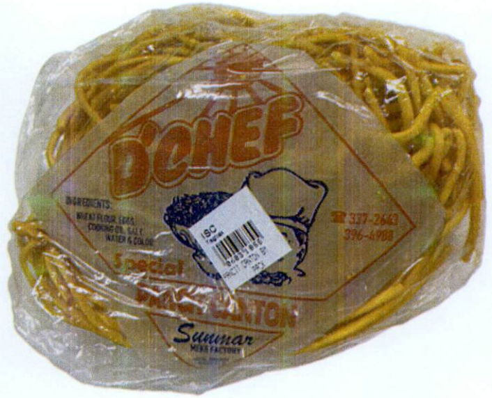
Figure 3. Unregistered D'CHEF Special Pancit Canton