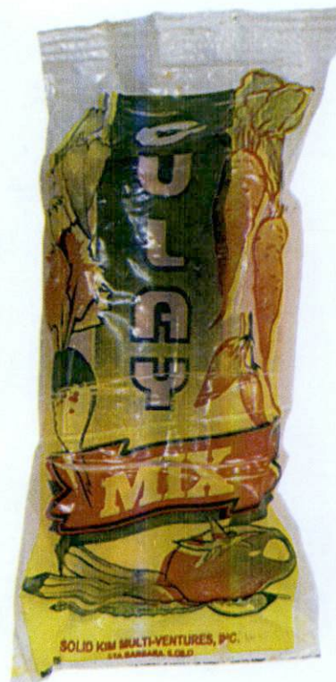
Figure 5. Unregistered (UNBRANDED) Gulay Mix