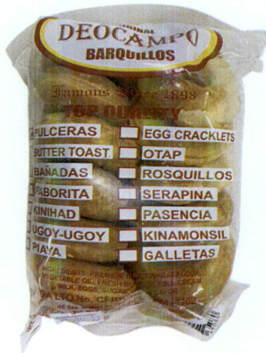
Figure 1. Unregistered ORIGINAL DEOCAMPO BARQUILLOS Pulceras

The Food and Drug Administration (FDA) warns all healthcare professionals and the general public NOT TO PURCHASE AND CONSUME the following unregistered food products: