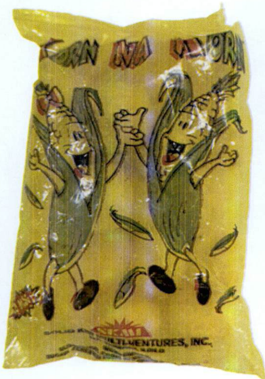
Figure 4. Unregistered (UNBRANDED) Korn na Korn