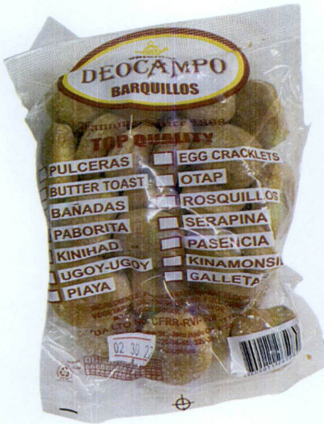
Figure 2. Unregistered ORIGINAL DEOCAMPO BARQUILLOS Paborita