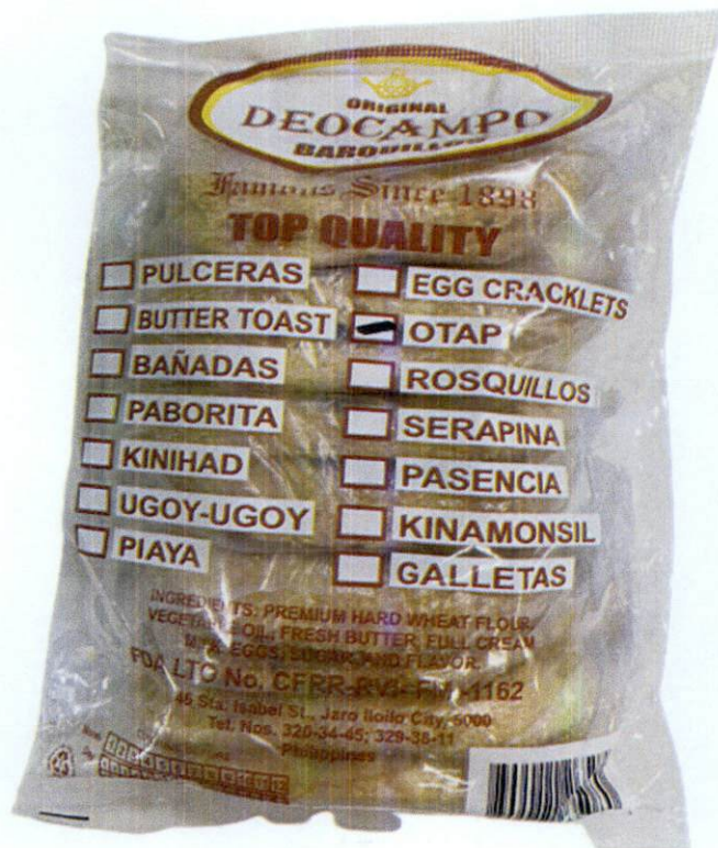
Figure 2. Unregistered ORIGINAL DEOCAMPO BARQUILLOS Otap