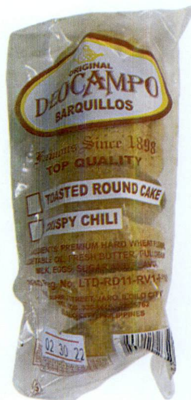
Figure 5. Unregistered ORIGINAL DEOCAMPO BARQUILLOS Toasted Round Cake