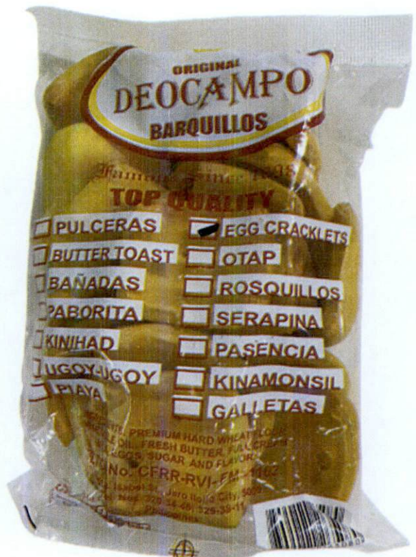
Figure 3. Unregistered ORIGINAL DEOCAMPO BARQUILLOS Egg Cracklets