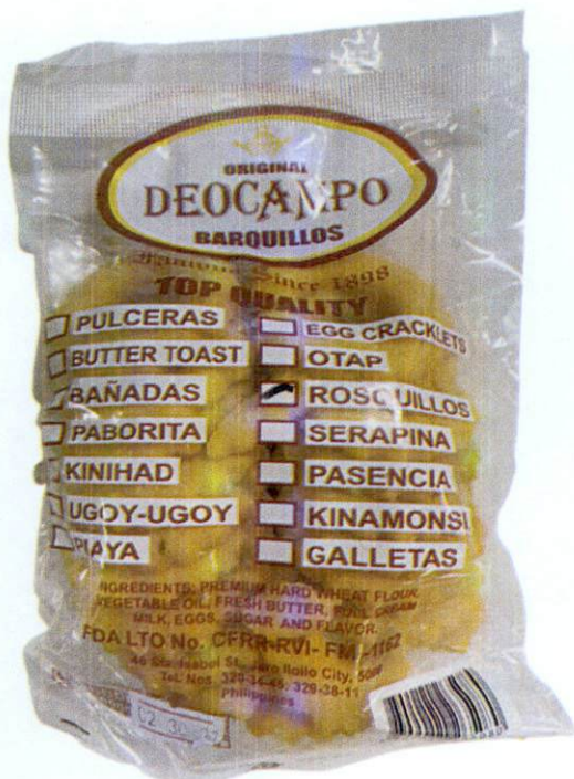
Figure 4. Unregistered ORIGINAL DEOCAMPO BARQUILLOS Rosquillos