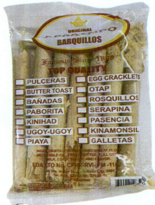
Figure 1. Unregistered ORIGINAL DEOCAMPO BARQUILLOS Barquillos

The Food and Drug Administration (FDA) warns all healthcare professionals and the general public NOT TO PURCHASE AND CONSUME the following unregistered food products: