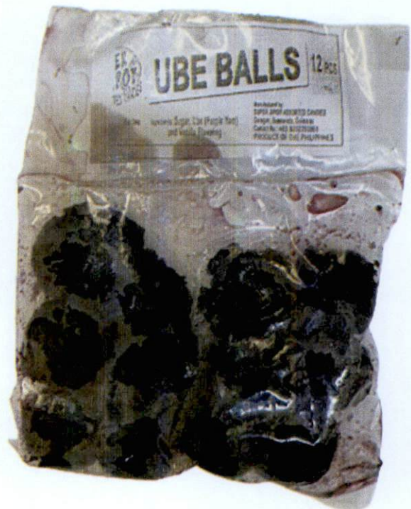
Figure 5. Unregistered SUPER JIPOY ASSTD. CANDIES Ube Balls