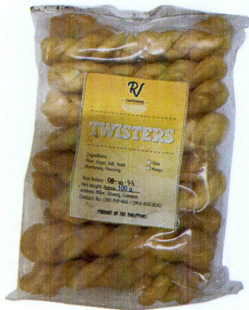
Figure 1. Unregistered RJ Twisters, 100 g

The Food and Drug Administration (FDA) warns all healthcare professionals and the general public NOT TO PURCHASE AND CONSUME the following unregistered food products: