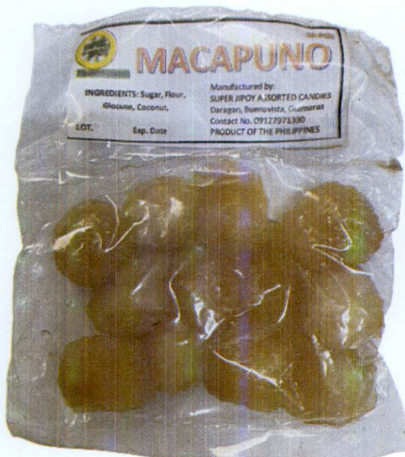
Figure 4. Unregistered SUPER JIPOY ASSTD. CANDIES Macapuno Balls