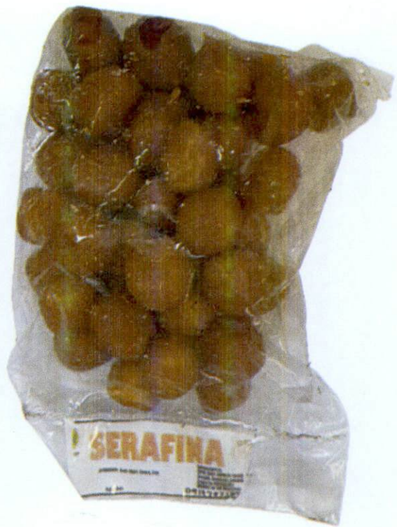
Figure 3. Unregistered SUPER JIPOY ASSTD. CANDIES Serafina