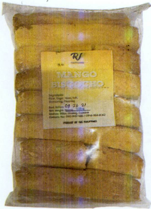
Figure 2. Unregistered RJ Mango Biscocho, 100 g