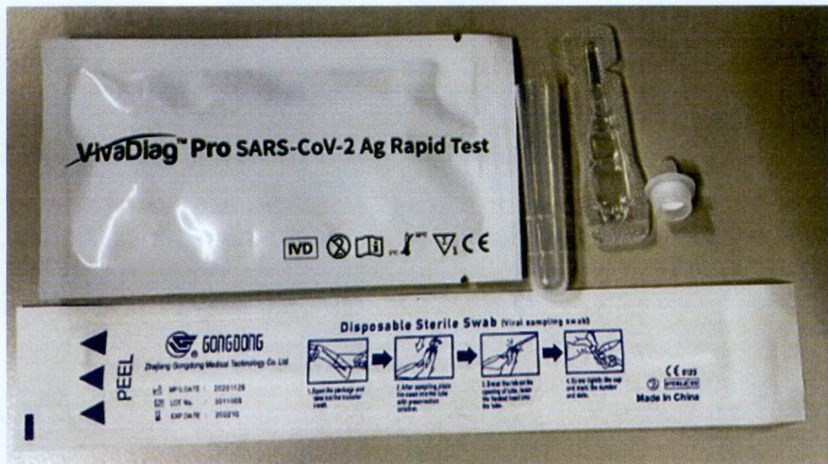
Figure 1. Uncertified Vivadiag Pro SARS-CoV-2 Ag Rapid Test

The Food and Drug Administration (FDA) warns all healthcare professionals and the general public NOT TO PURCHASE AND USE the uncertified COVID-19 test kit: