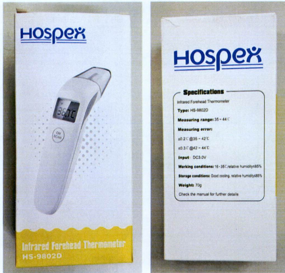
Figure 1. Unregistered Hospex Infrared (HS-9802D) Forehead Thermometer

The Food and Drug Administration (FDA) warns all healthcare professionals and the general public NOT TO PURCHASE AND USE the unregistered medical device product: