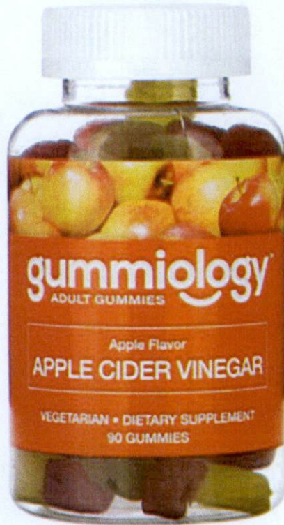
Figure 2. Unregistered GUMMIOLGY Adult Gummies Apple Cider Vinegar Apple Flavor