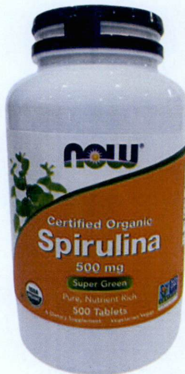
Figure 1. Unregistered NOW Certified Organic Spirulina Dietary Supplement

The Food and Drug Administration (FDA) warns all healthcare professionals and the general public NOT TO PURCHASE AND CONSUME the following unregistered food supplements: