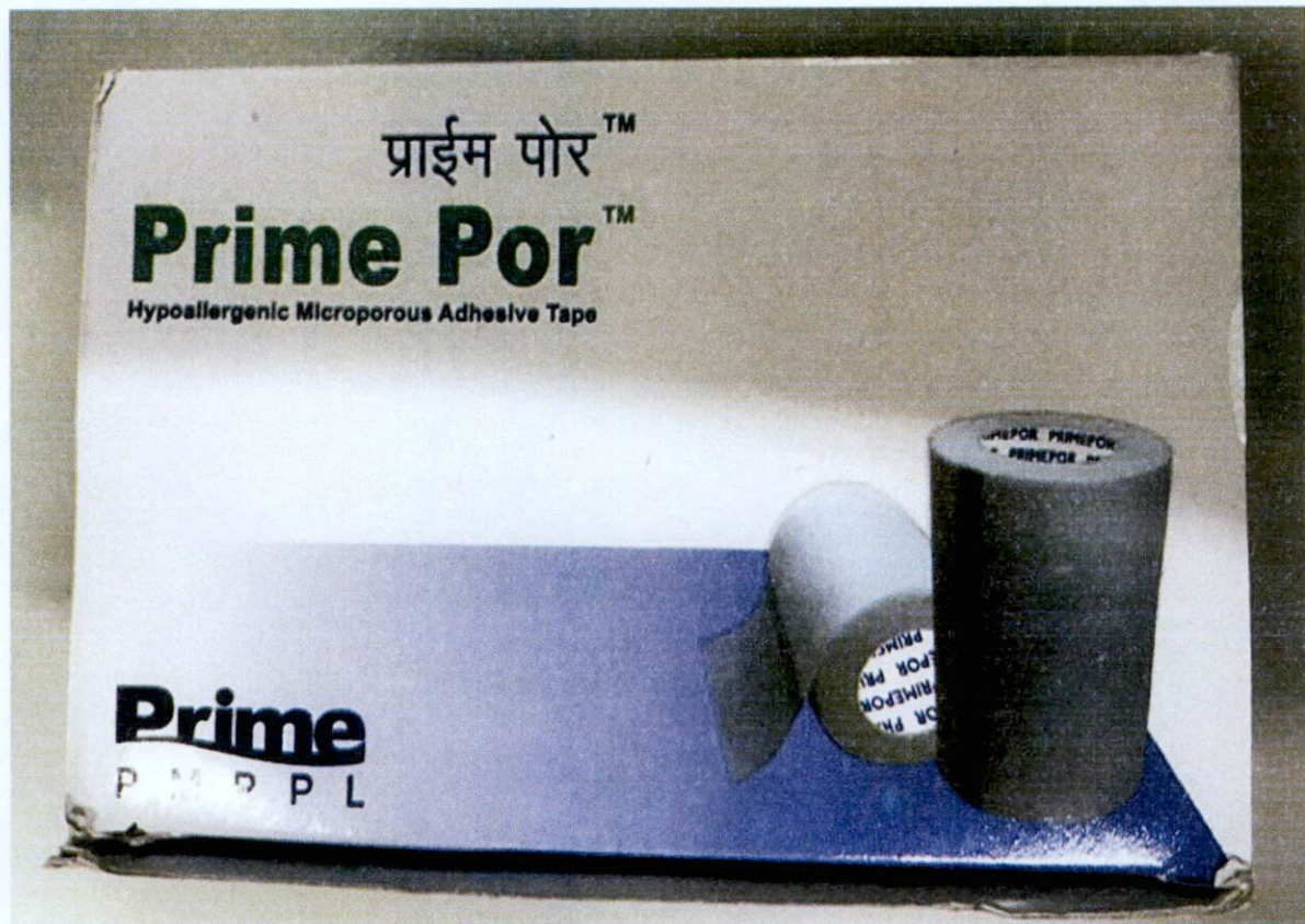
Figure 1. Unnotified Prime Por™ Hypoallergenic Microporous Adhesive Tape

The Food and Drug Administration (FDA) warns all healthcare professionals and the general public NOT TO PURCHASE AND USE the unnotified medical device product: