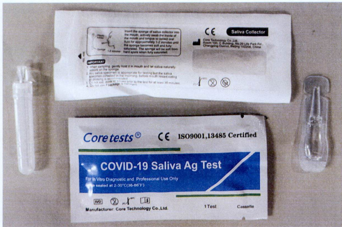
Figure 1. Uncertified Core Tests® COVID-19 Saliva Ag Test

The Food and Drug Administration (FDA) warns all healthcare professionals and the general public NOT TO PURCHASE AND USE the uncertified COVID-19 test kit: