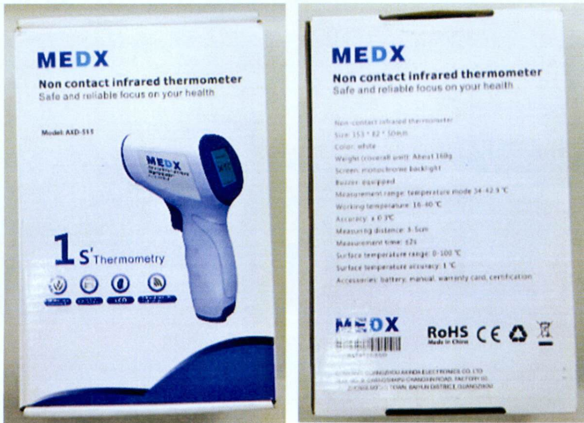
Figure 1. Unregistered Medx non-contact Infrared Thermometer AXD-515

The Food and Drug Administration (FDA) warns all healthcare professionals and the general public NOT TO PURCHASE AND USE the unregistered medical device products: