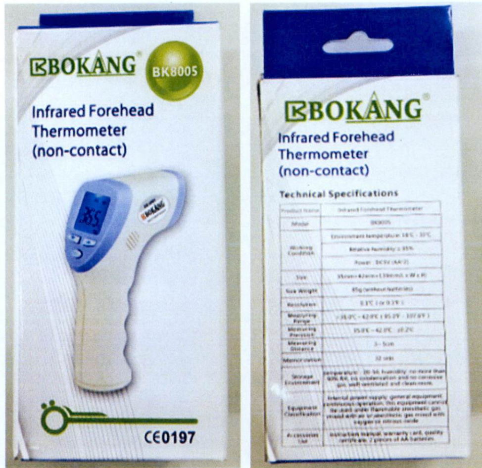
Figure 2. Unregistered Bokang® Infrared Forehead Thermometer (non-contact) BK8005

The FDA verified through post-marketing surveillance that the above mentioned medical device products are not registered and no corresponding Product Registration Certificates have been issued. Pursuant to the Republic Act No. 9711, otherwise known as the “Food and Drug Administration Act of 2009”, the manufacture, importation, exportation, sale, offering for sale, distribution, transfer, non-consumer use, promotion, advertising or sponsorship of health products without the proper authorization is prohibited.