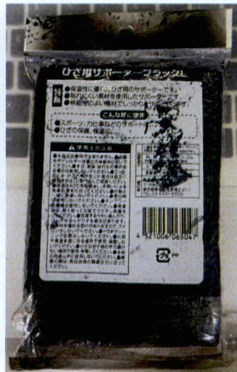
Figure 1. Misbranded Fit Supporter – Black Knee Supporter/ L (In Foreign Characters)