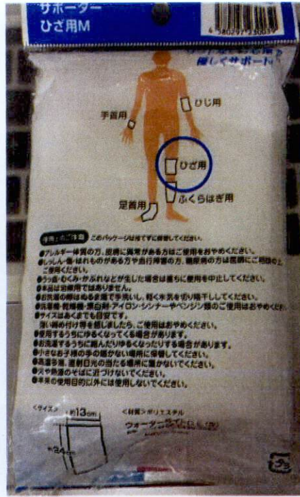
Figure 4. Misbranded Supporter Knee (In Foreign Characters)