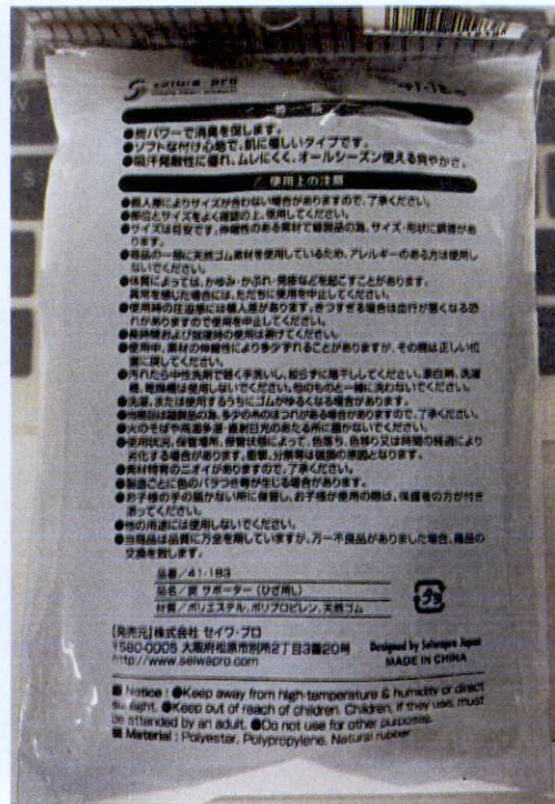
Figure 5. Misbranded Charcoal Supporter for Knee/ L (In Foreign Characters)