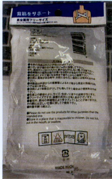
Figure 3. Misbranded Fits Supporter for Spine Band Unisex Free Size (In Foreign Characters)