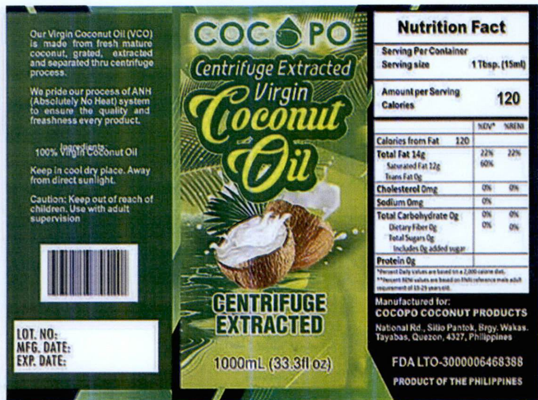
Figure 1. Approved label of COCOPO Virgin Coconut Oil, FR-4000008859675 issued on 03 February 2022 valid until 03 February 2027.

The Food and Drug Administration (FDA) informs the public that the food product COCOPO Virgin Coconut Oil has been registered by the Market Authorization Holder (MAH) Cocopo Coconut Products in accordance to existing FDA rules and regulations.