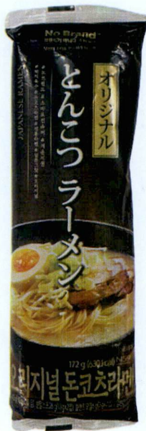
Figure1. Registered (NB) NO BRAND Tonkutso Ramen (Original) (Japanese Ramen) with FR No. 4000007712429 valid until 06 December 2023.

The Food and Drug Administration (FDA) informs the public that the food product has been registered by the Market Authorization Holder (MAH), ROBINSONS SUPERMARKET CORPORATION , in accordance to existing FDA rules and regulations: