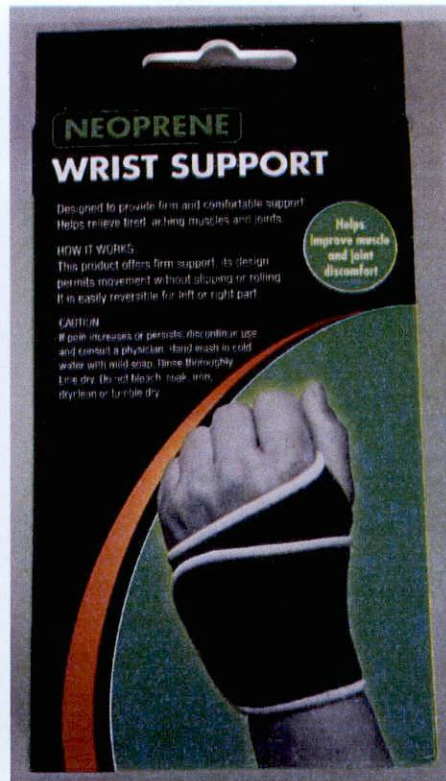
Figure 2. Unnotified UBL® Neoprene Wrist Support