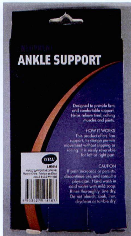
Figure 3. Unnotified UBL® Neoprene Ankle Support