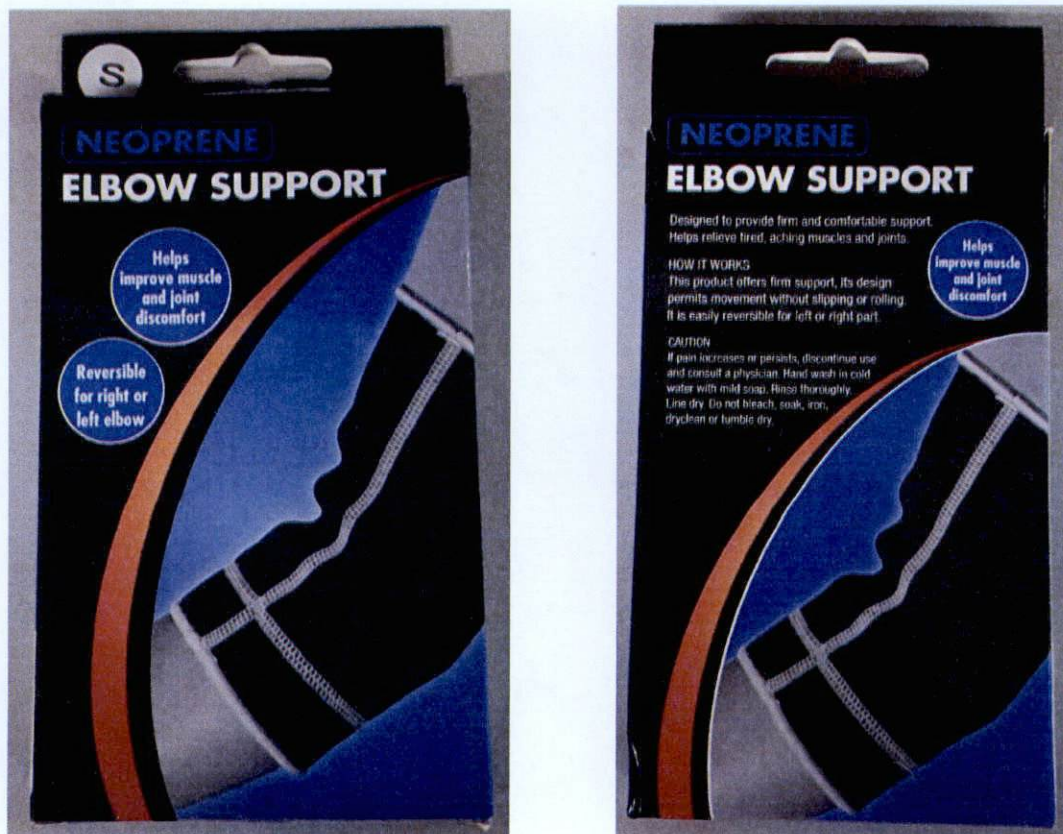
Figure 1. Unnotified UBL ® Neoprene Elbow Support

The Food and Drug Administration (FDA) warns all healthcare professionals and the general public NOT TO PURCHASE AND USE the following unnotified medical device products: