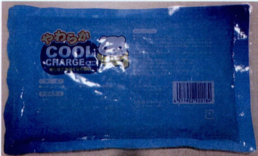
Figure 5. Unnotified Cool Charge 400g