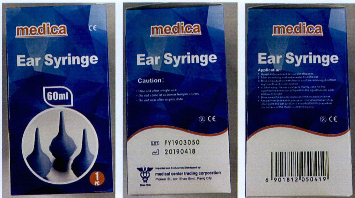
Figure 1. Unnotified Medica Ear Syringe 60ml

The Food and Drug Administration (FDA) warns all healthcare professionals and the general public NOT TO PURCHASE AND USE the unnotified medical device product: