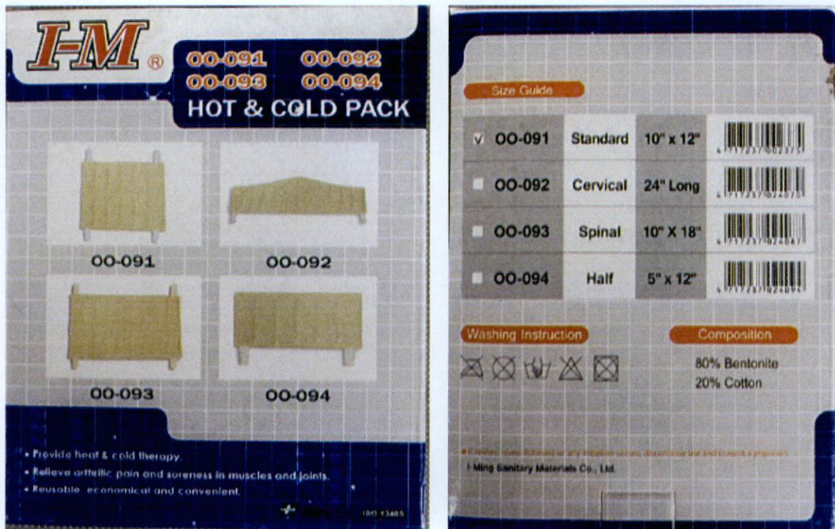
Figure 1. Unnotified I-M Hot & Cold Pack

The Food and Drug Administration (FDA) warns all healthcare professionals and the general public NOT TO PURCHASE AND USE the unnotified medical device product: