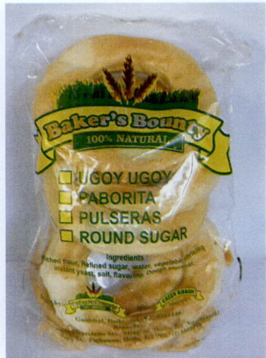
Figure 3. Unregistered BAKER'S BOUNTY (Pulseras)