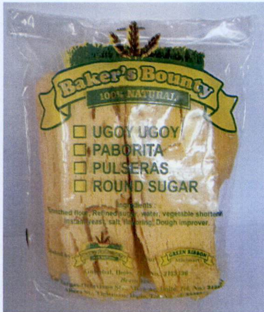
Figure 4. Unregistered BAKER'S BOUNTY (Kinihad)