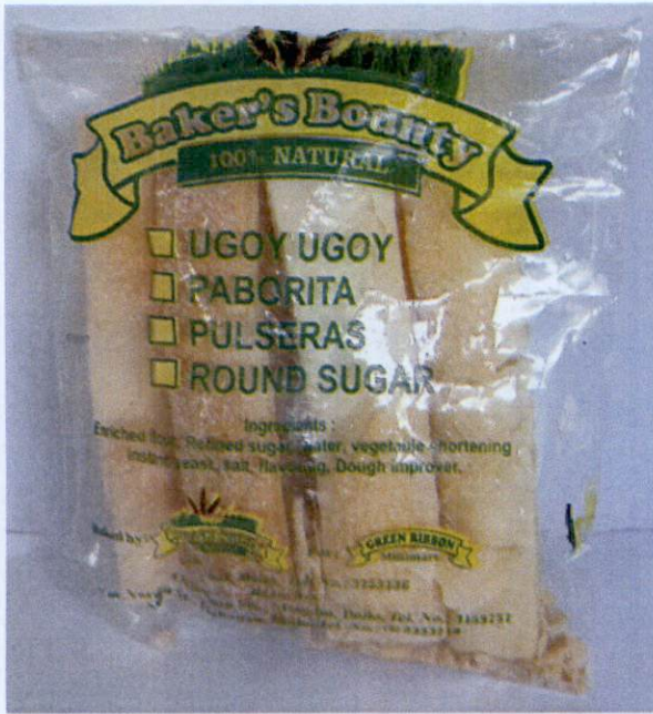
Figure 2. Unregistered BAKER'S BOUNTY (Ugoy-Ugoy)