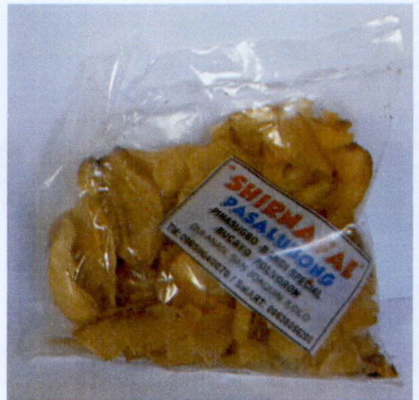
Figure 5. Unregistered SHIRNAFAE PASALUBONG Banana Chips