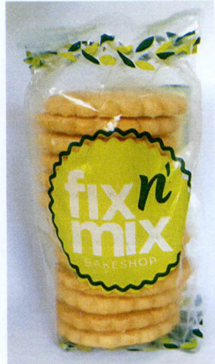
Figure 3. Unregistered FIX N MIX (Rosquillos)