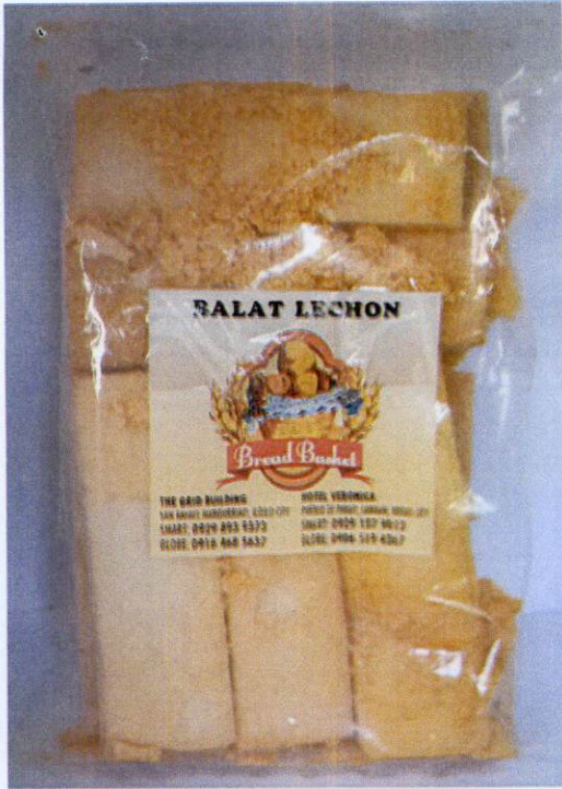
Figure 2. Unregistered BREADBASKET Balat Lechon