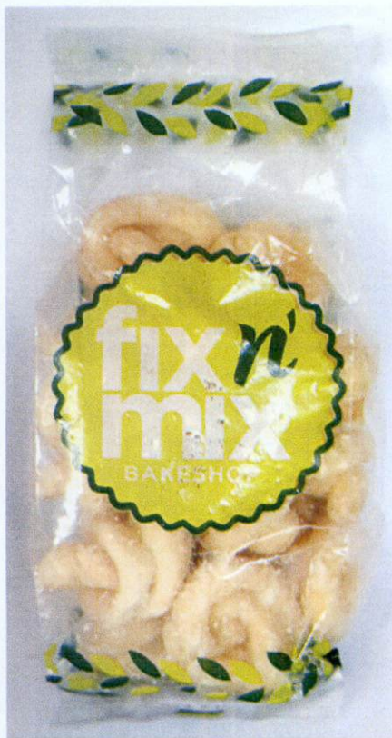
Figure 4. Unregistered FIX N MIX (Lubid- Lubid)