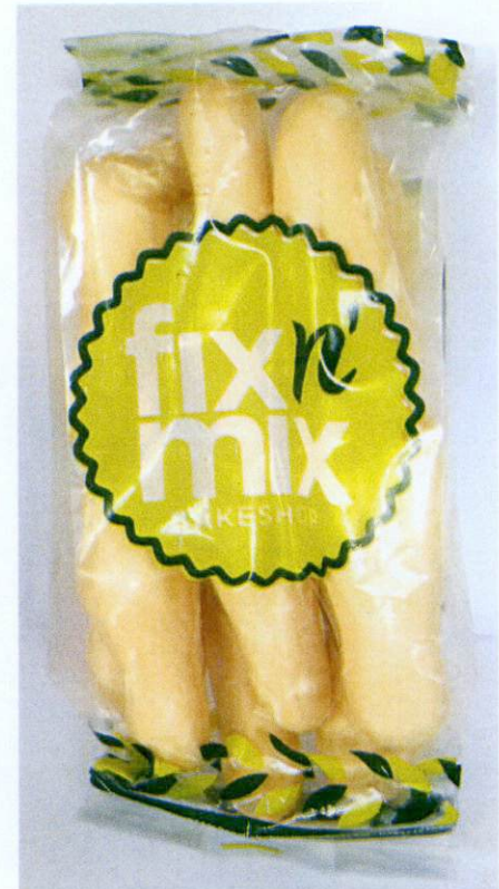
Figure 5. Unregistered FIX N MIX (Breadstick)