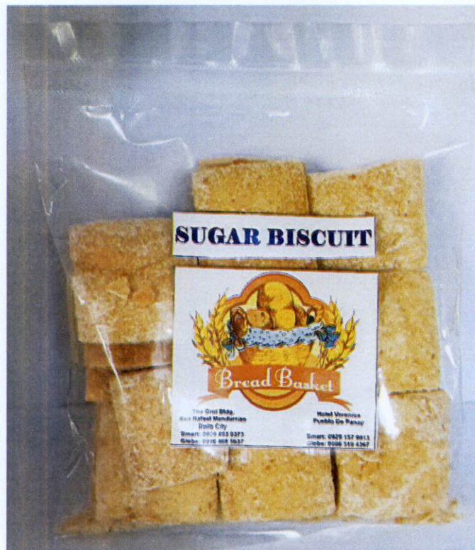
Figure 1. Unregistered BREADBASKET Sugar Biscuit

The Food and Drug Administration (FDA) warns all healthcare professionals and the general public NOT TO PURCHASE AND CONSUME the following unregistered food products: