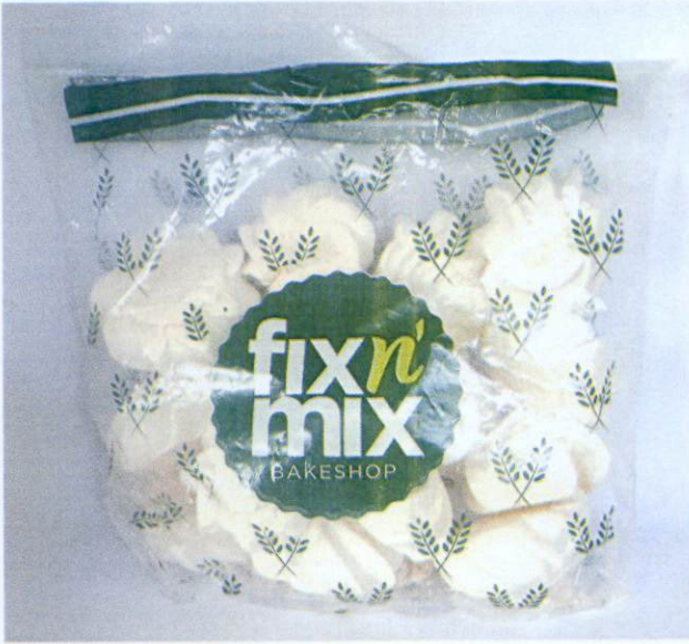
Figure 2. Unregistered FIX N MIX Meringue