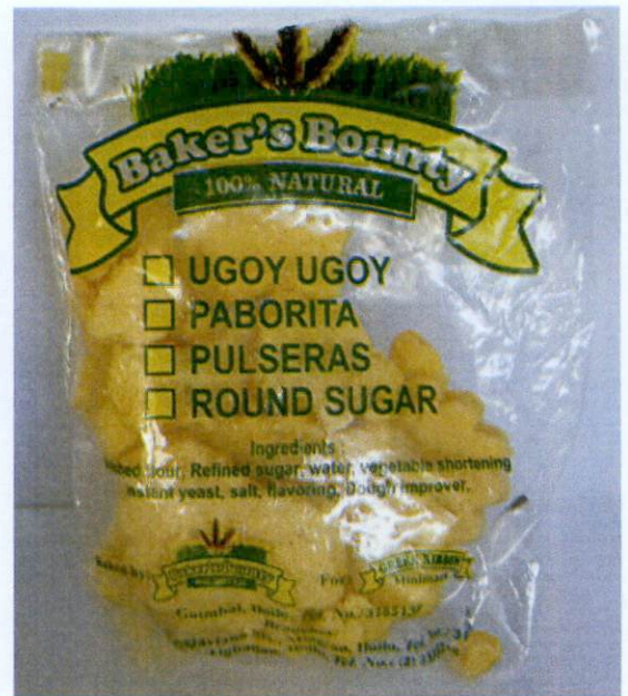
Figure 5. Unregistered BAKER'S BOUNTY (Round Sugar)