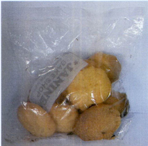
Figure 4. Unregistered JANINE BAKESHOP (Small Cookies)