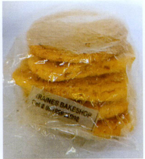
Figure 3. Unregistered IRAINES BAKESHOP (Flat Cookies)