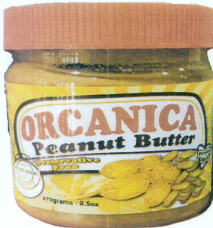
Figure 1. Unregistered ORCANICA Peanut Butter

The Food and Drug Administration (FDA) warns all healthcare professionals and the general public NOT TO PURCHASE AND CONSUME the unregistered food product: