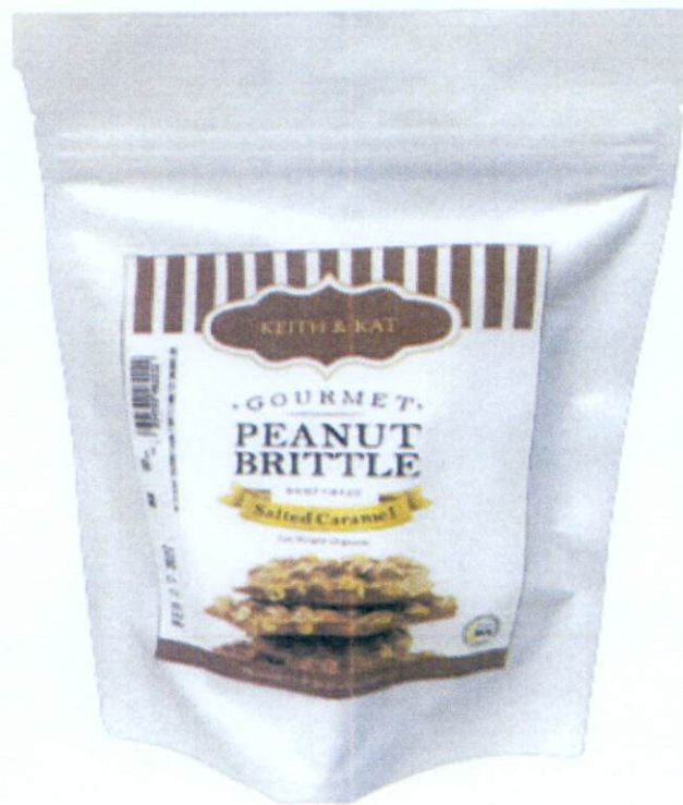
Figure 1. Unregistered KEITH & KAT Gourmet Peanut Brittle Salted Caramel

The Food and Drug Administration (FDA) warns all healthcare professionals and the general public NOT TO PURCHASE AND CONSUME the unregistered food product: