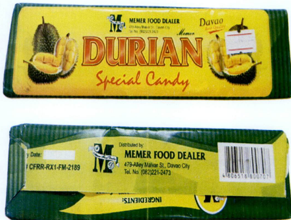
Figure 1. Unregistered MEMER Durian Special Candy

The Food and Drug Administration (FDA) warns all healthcare professionals and the general public NOT TO PURCHASE AND CONSUME the unregistered food product: