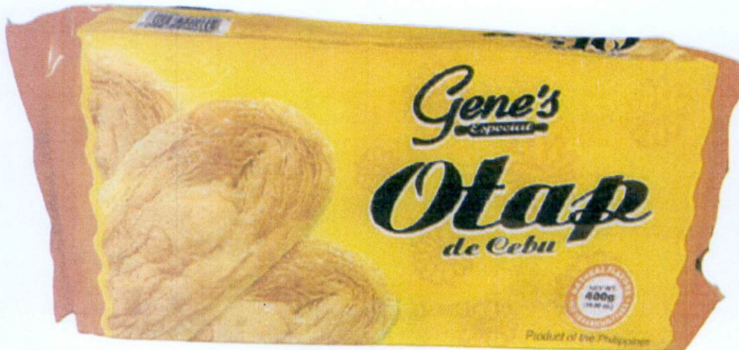
Figure 1. Unregistered GENE'S ESPECIAL Otap de Cebu

The Food and Drug Administration (FDA) warns all healthcare professionals and the general public NOT TO PURCHASE AND CONSUME the unregistered food product: