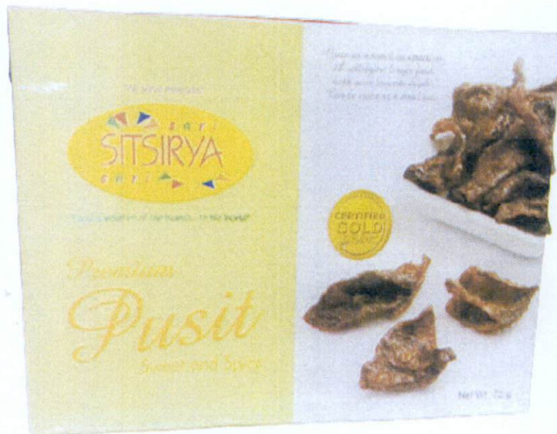
Figure 1. Unregistered SITSIRYA SARI SARI Premium Pusit Sweet and Spicy

The Food and Drug Administration (FDA) warns all healthcare professionals and the general public NOT TO PURCHASE AND CONSUME the unregistered food product: