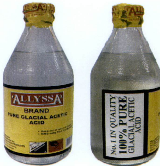
Figure 1. Unregistered ALLYSSA BRAND Pure Glacial Acetic Acid

The Food and Drug Administration (FDA) warns all healthcare professionals and the general public NOT TO PURCHASE AND CONSUME the unregistered food product: