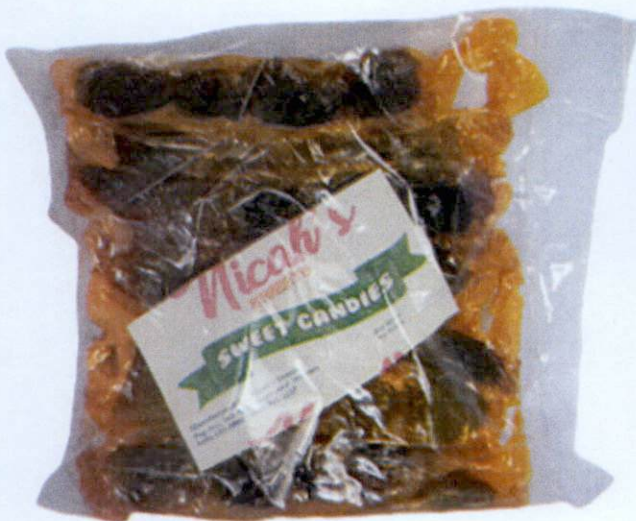
Figure 4. Unregistered NICAH'S SWEETS Sweet Candies