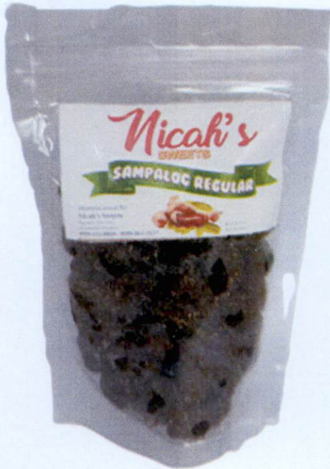
Figure 2. Unregistered NICAH'S SWEETS Sampaloc Regular