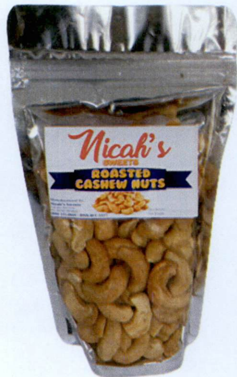
Figure 5. Unregistered NICAH'S SWEETS Roasted Cashew Nuts