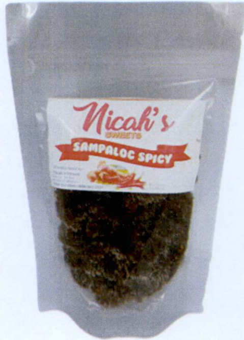
Figure 3. Unregistered NICAH'S SWEETS Sampaloc Spicy