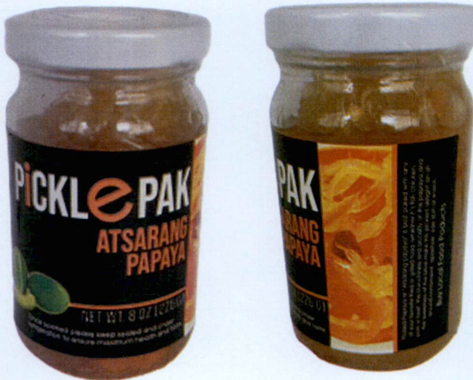
Figure 1. Unregistered PICKLEPAK Atsarang Papaya

The Food and Drug Administration (FDA) warns all healthcare professionals and the general public NOT TO PURCHASE AND CONSUME the following unregistered food products: